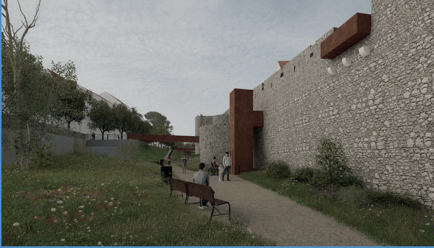
Small bastion with a new elevator and entrance to the Staromestská street tunnel