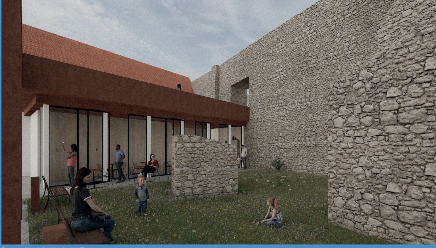
Renovation of the Northwest Tower area