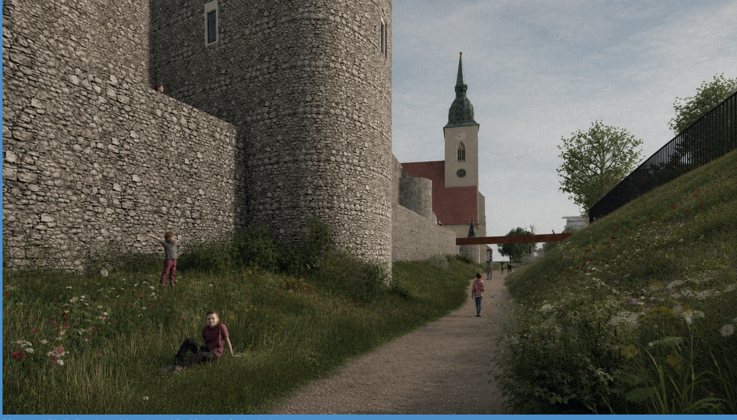
Moat and Bird's Bastion with a view of St. Martin's Cathedral