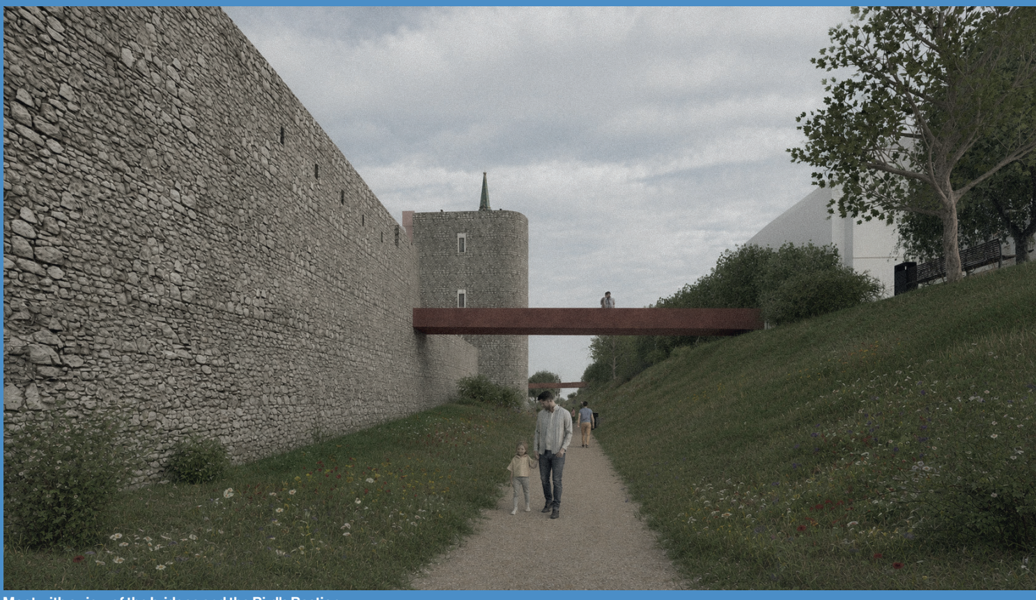
Moat with a view of the bridges and the Bird's Bastion