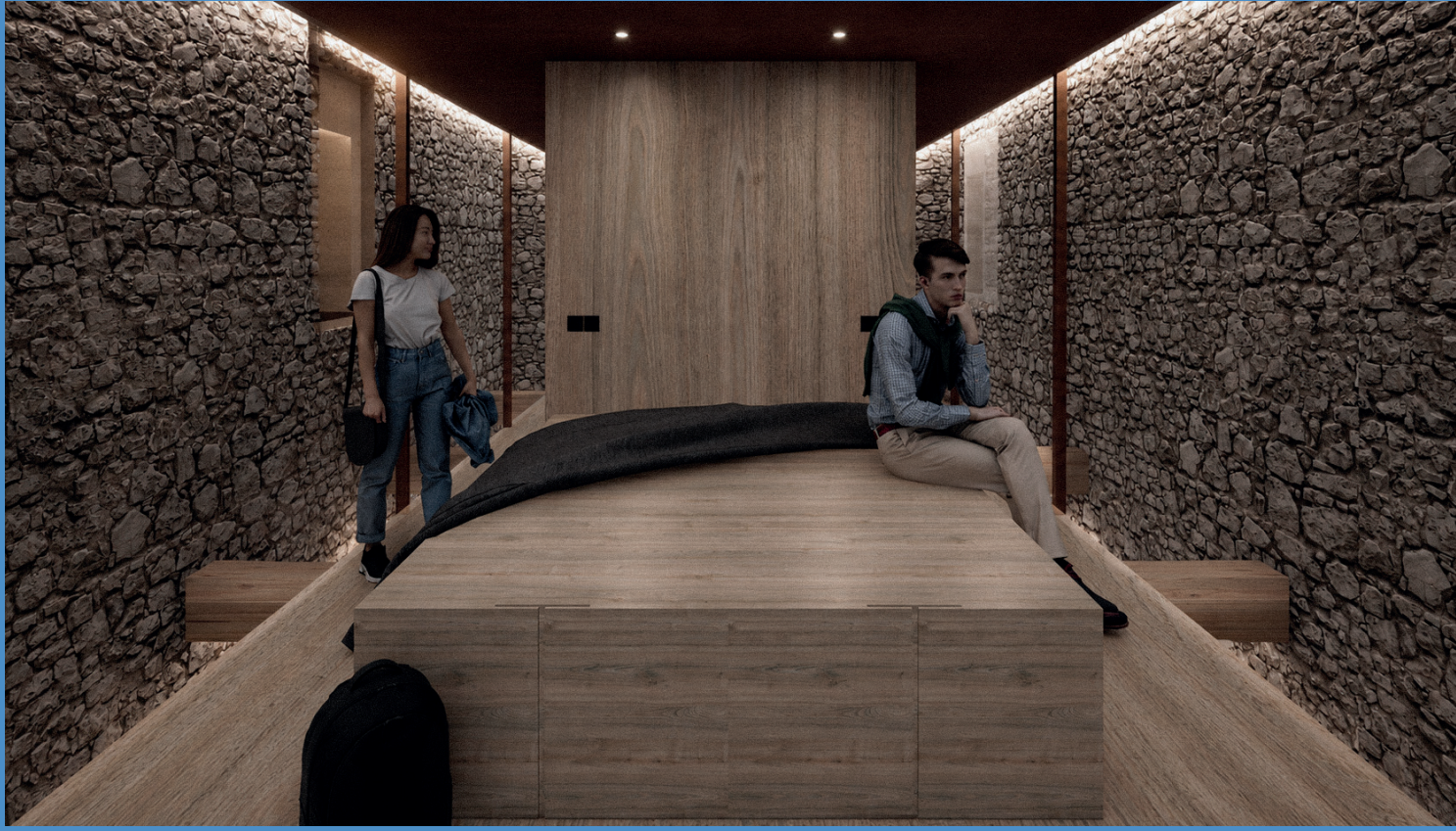
Interior of the proposed cafe in the Bird's Bastion