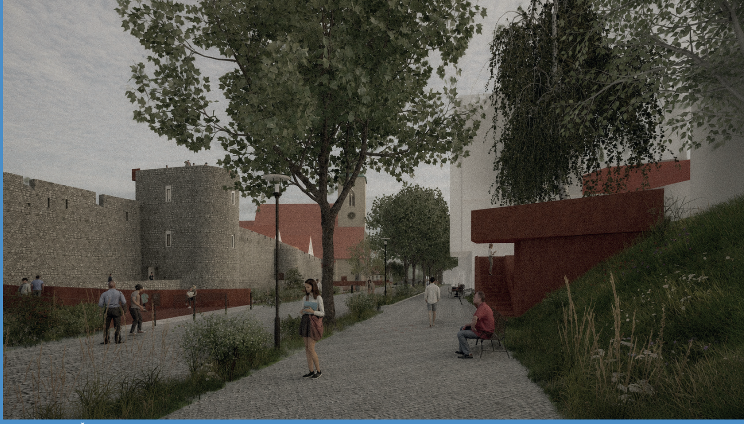
Revitalization of Židovská Street