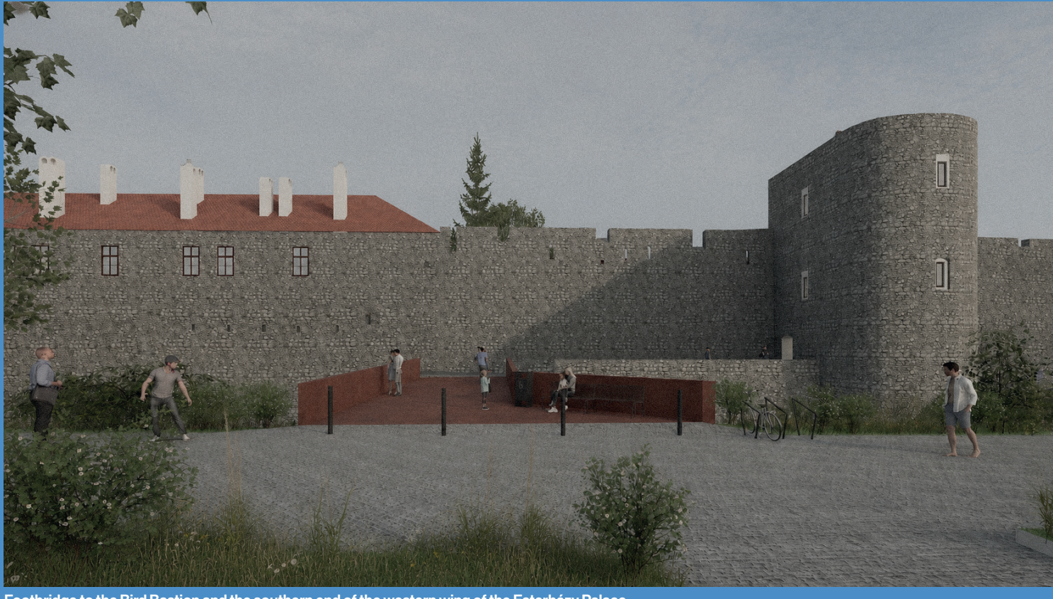
Footbridge to the Bird Bastion and the southern end of the western wing of the Esterházy Palace