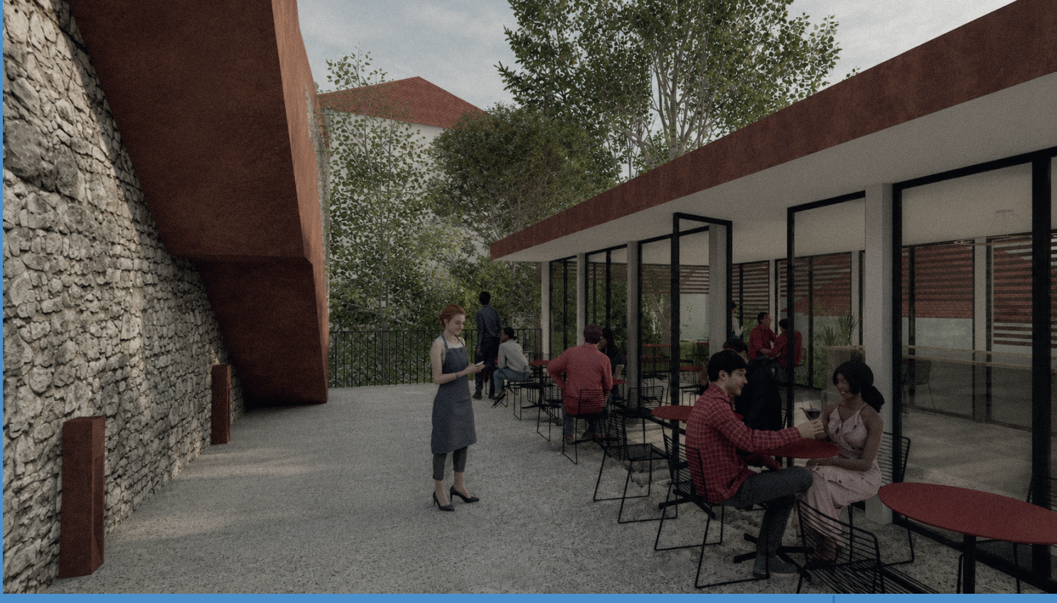
New cafe at the Bird's Bastion