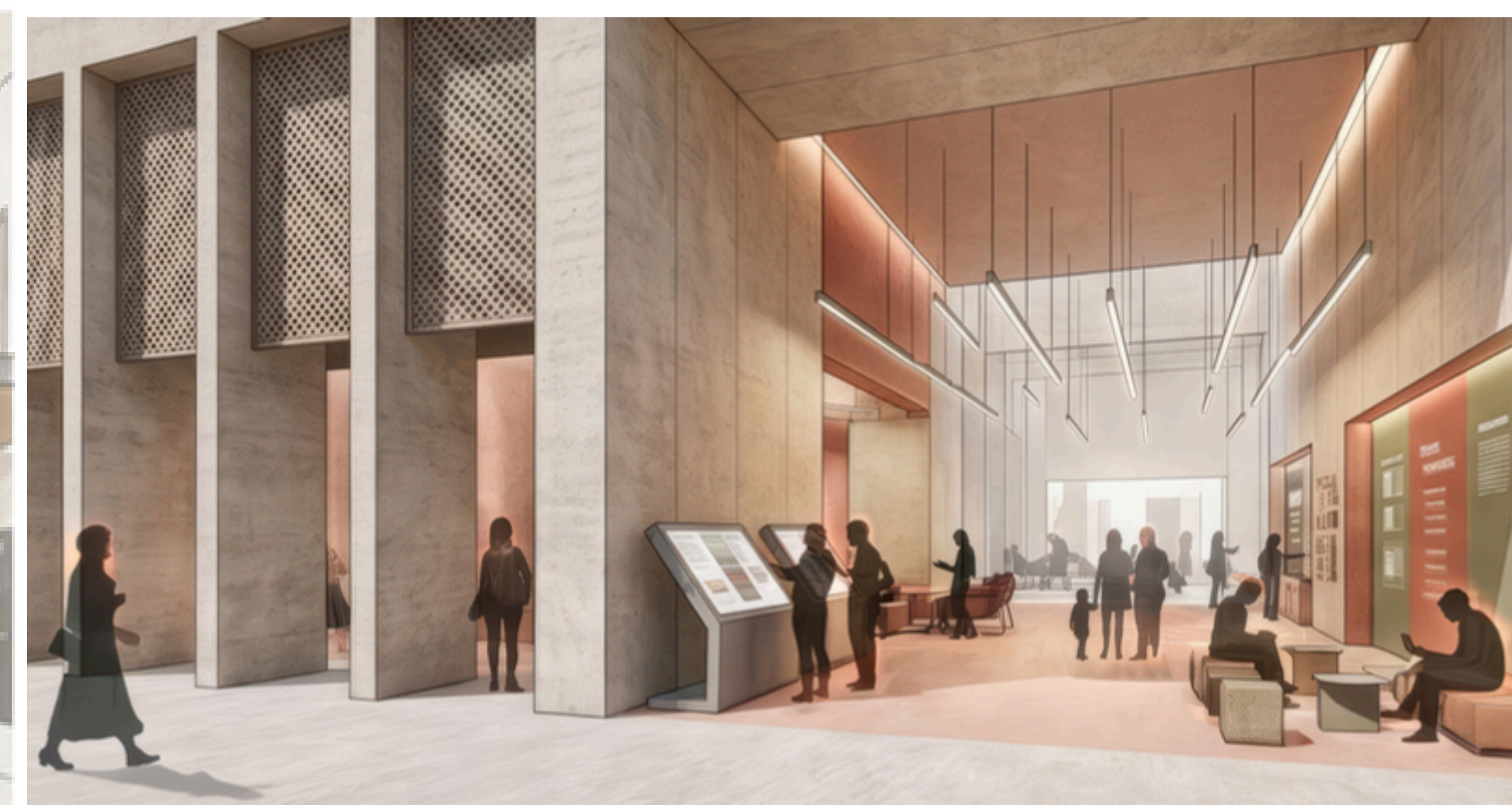
MONUMENTAL PUBLIC ENTRANCE