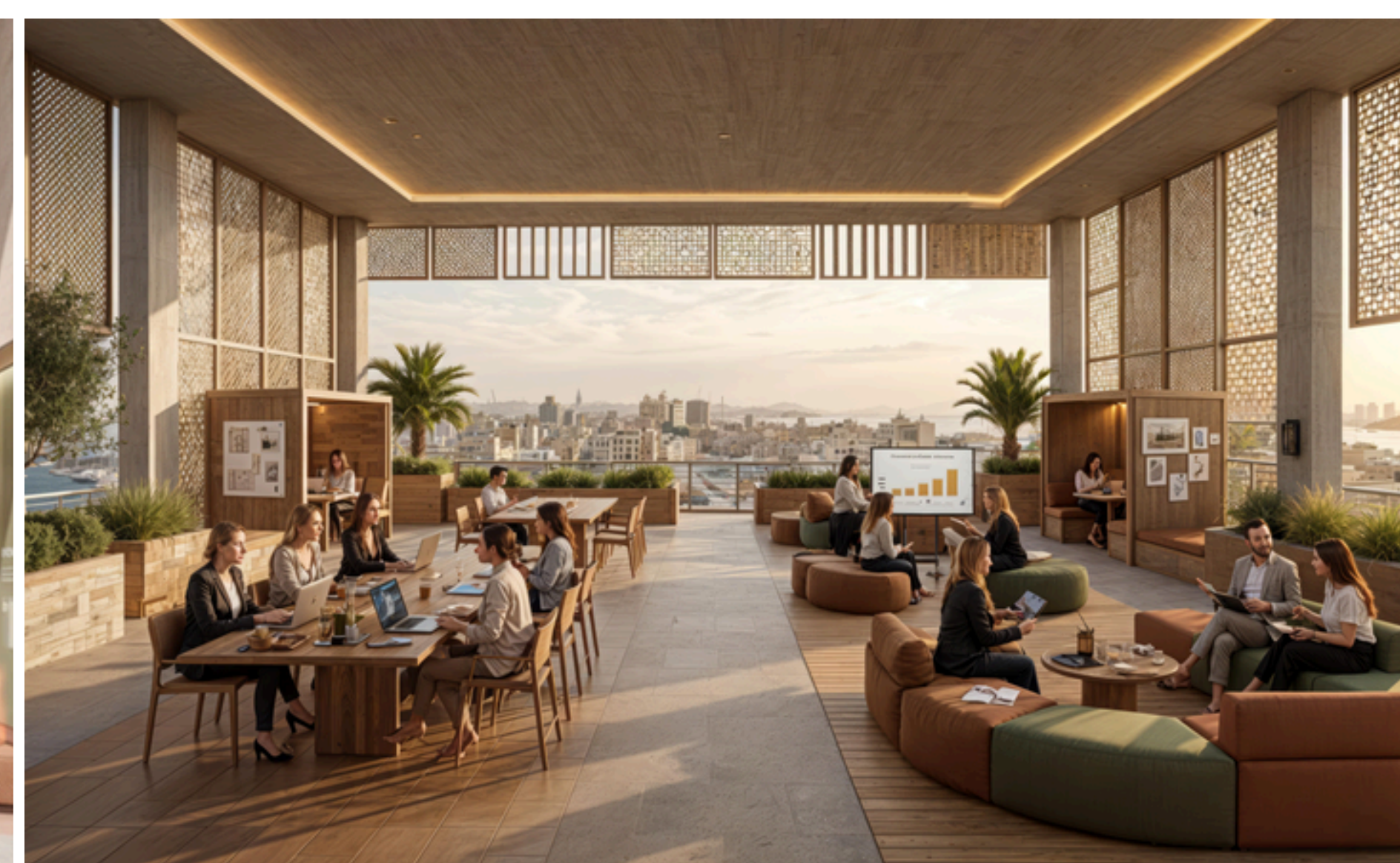
TERRACE CO-WORKING SPACE