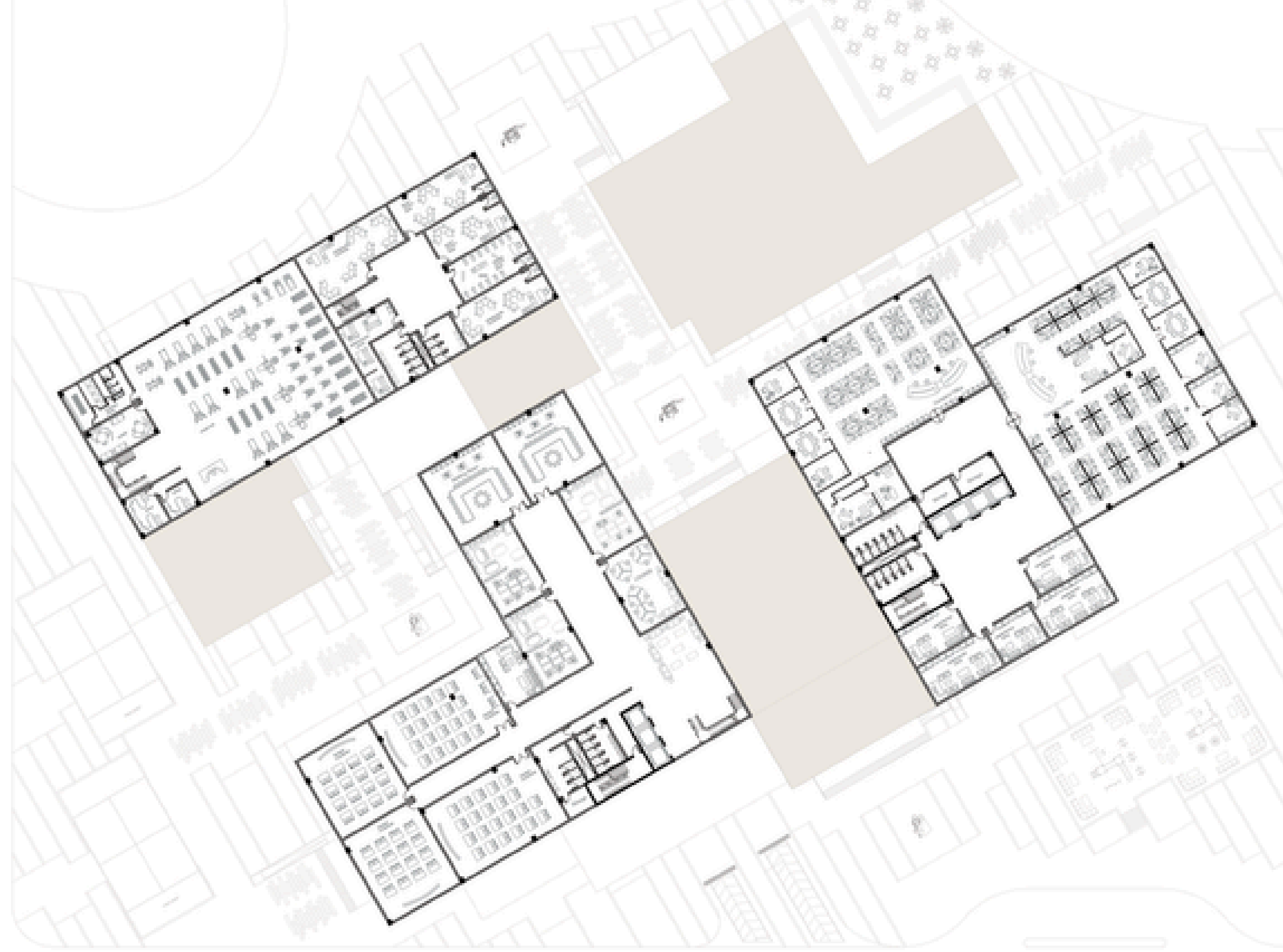
THIRD FLOOR SCALE 1:400