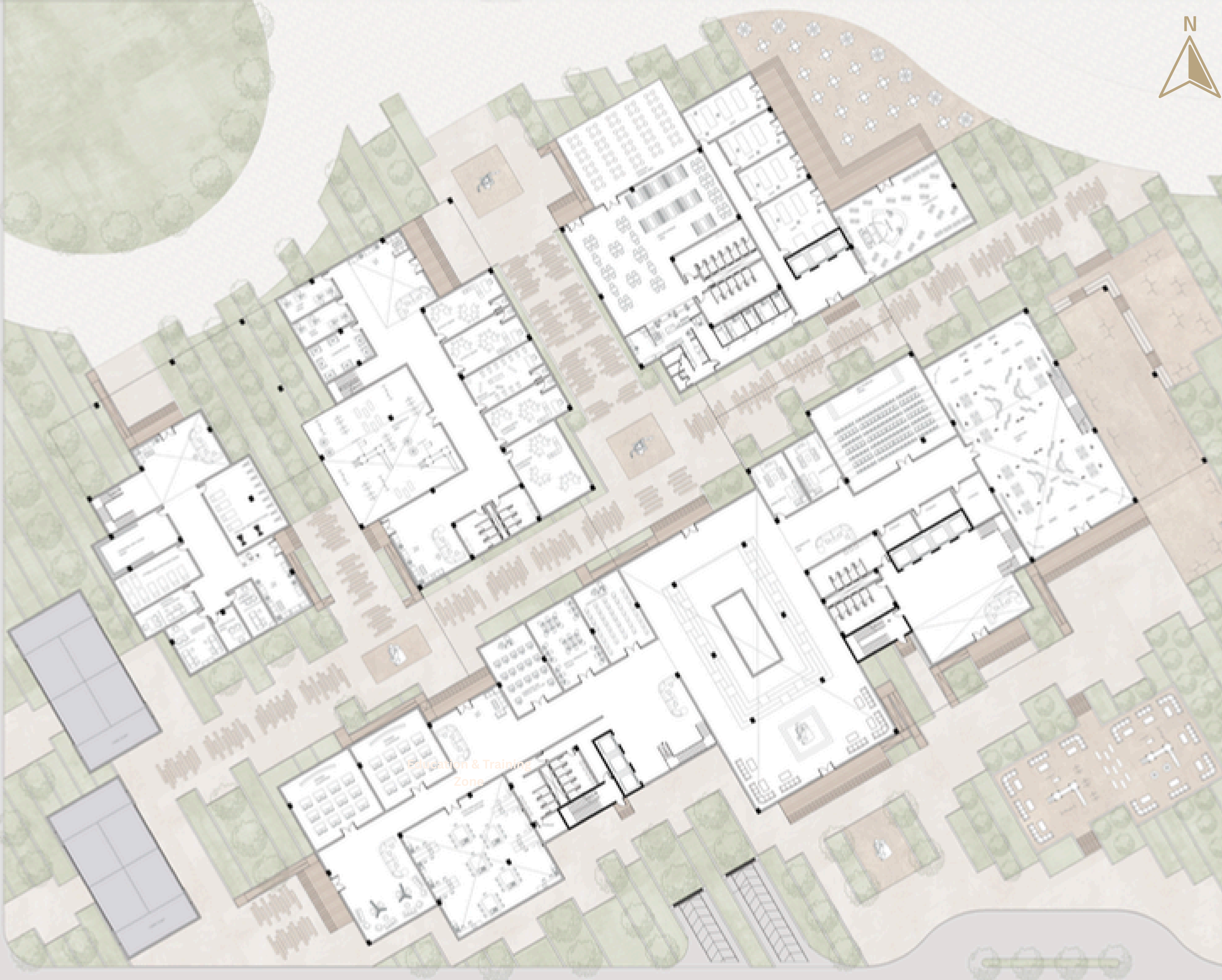
GROUND FLOOR SCALE 1:200