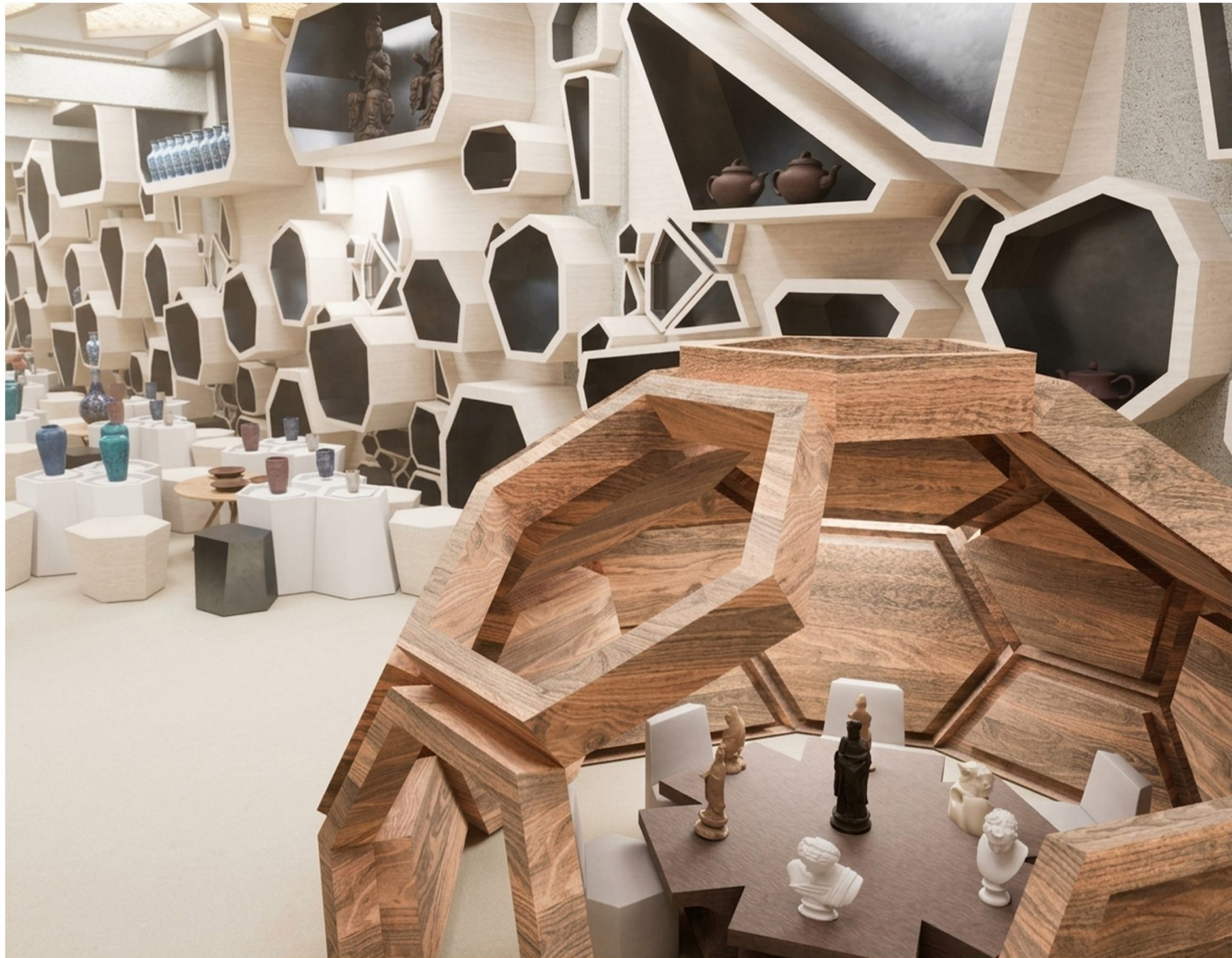
THE WORKSHOP PERSPECTIVE