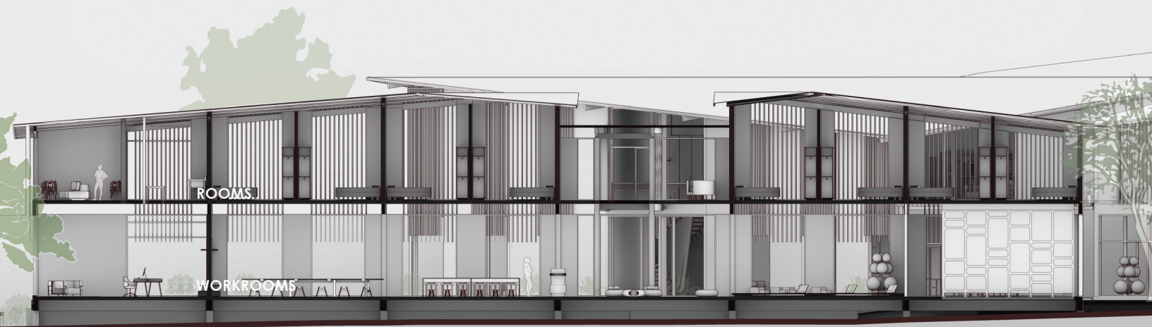
SECTION A-A (Lobby + Consulting rooms)