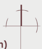
LEVEL TWO PLAN (+0.00m)