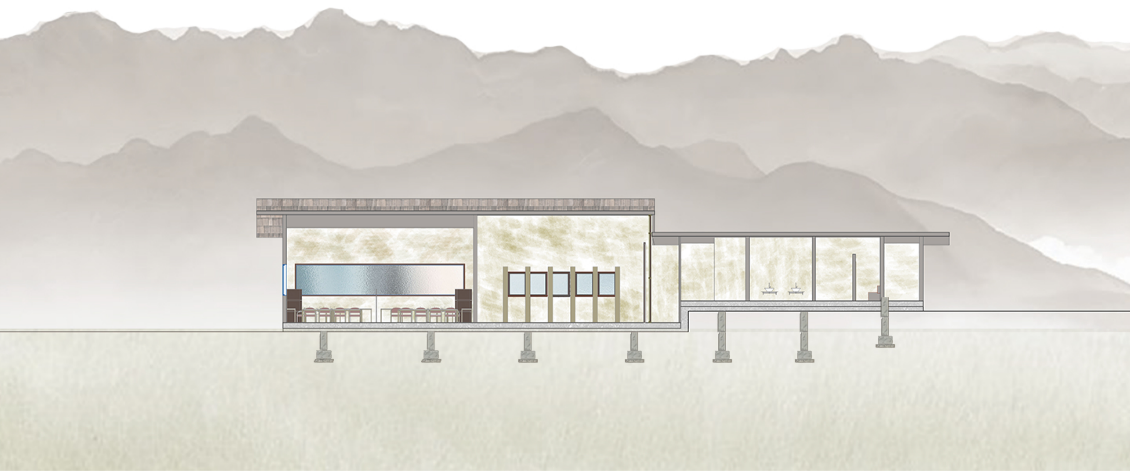
FIRST SECTION 1/50