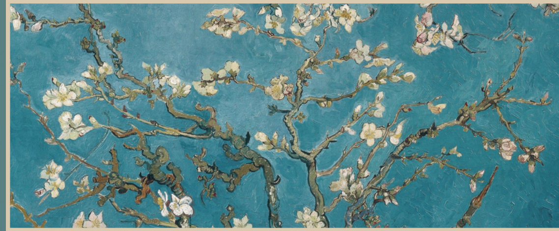
ALMOND BLOSSOM Rebirth & Hope