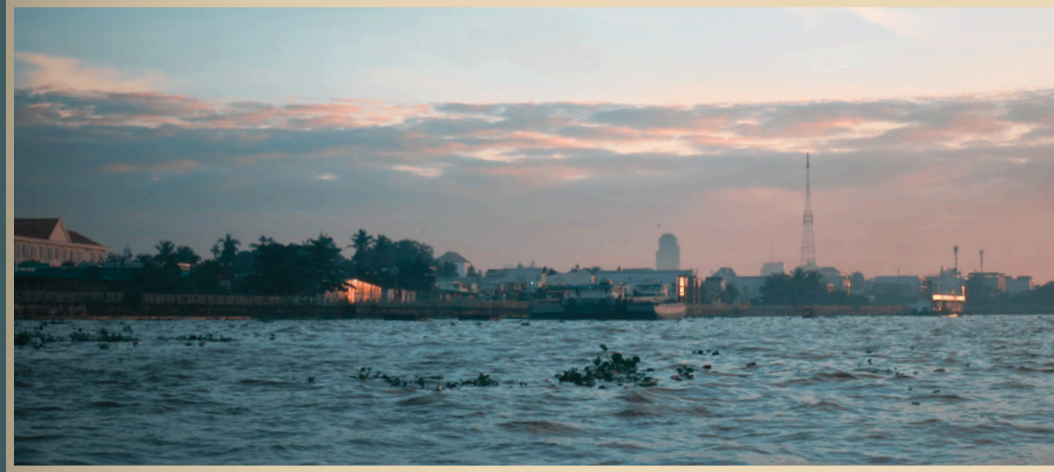
MEKONG RIVER Spirit of Southern Vietnam