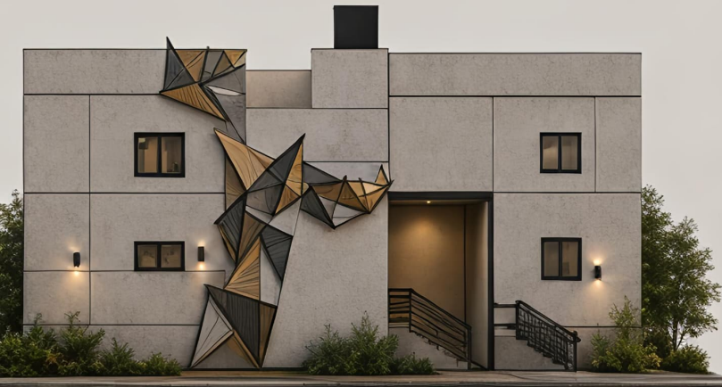
ELEVATION - NORTH