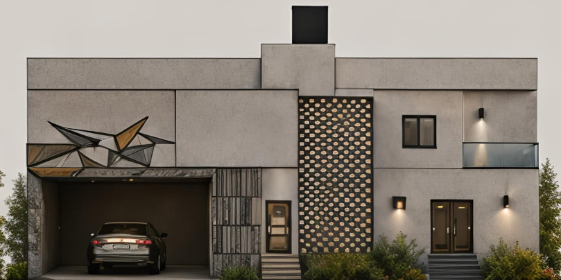
ELEVATION - WEST