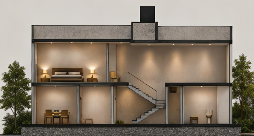
SECTION - NORTH