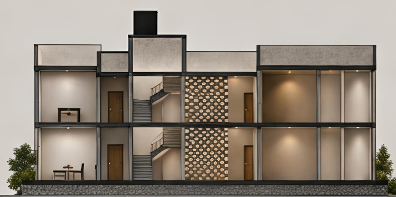
SECTION - EAST