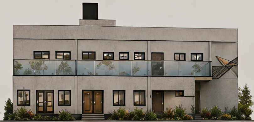
ELEVATION - EAST