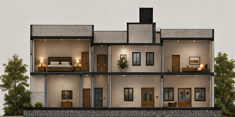
SECTION - WEST