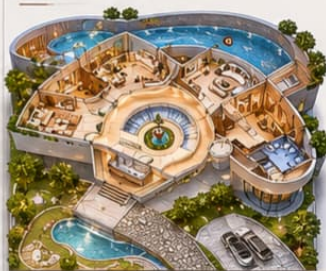
GROUND FLOOR ISOMETRIC