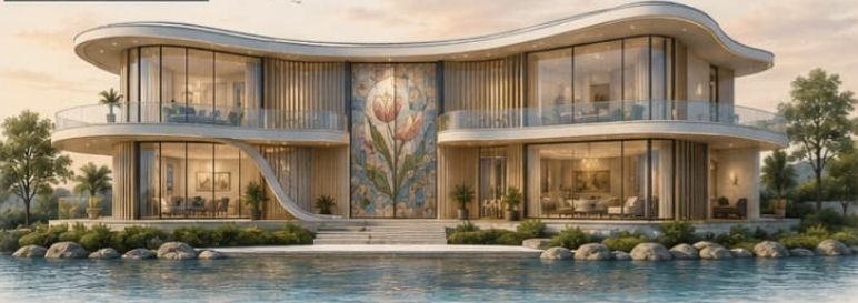
SOUTH SIDE ELEVATION