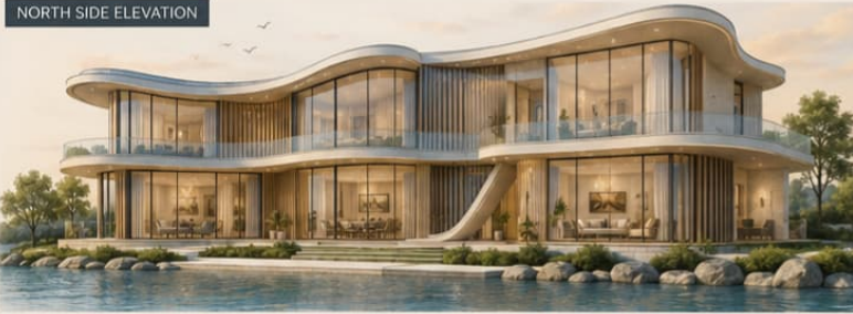
NORTH SIDE ELEVATION