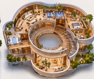
FIRST FLOOR ISOMETRIC