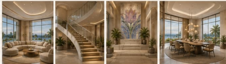
LIVING AREA FLOATING STAIRCASE LOBBY / ENTRANCE DINING AREA