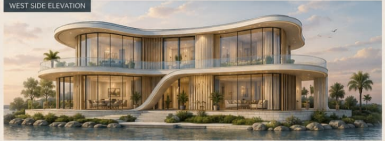
WEST SIDE ELEVATION