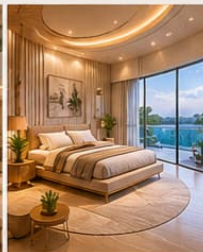
BEDROOM (FIRST FLOOR)