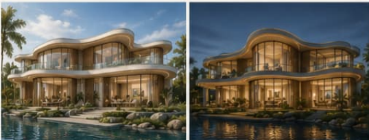
DAY VIEW EVENING VIEW