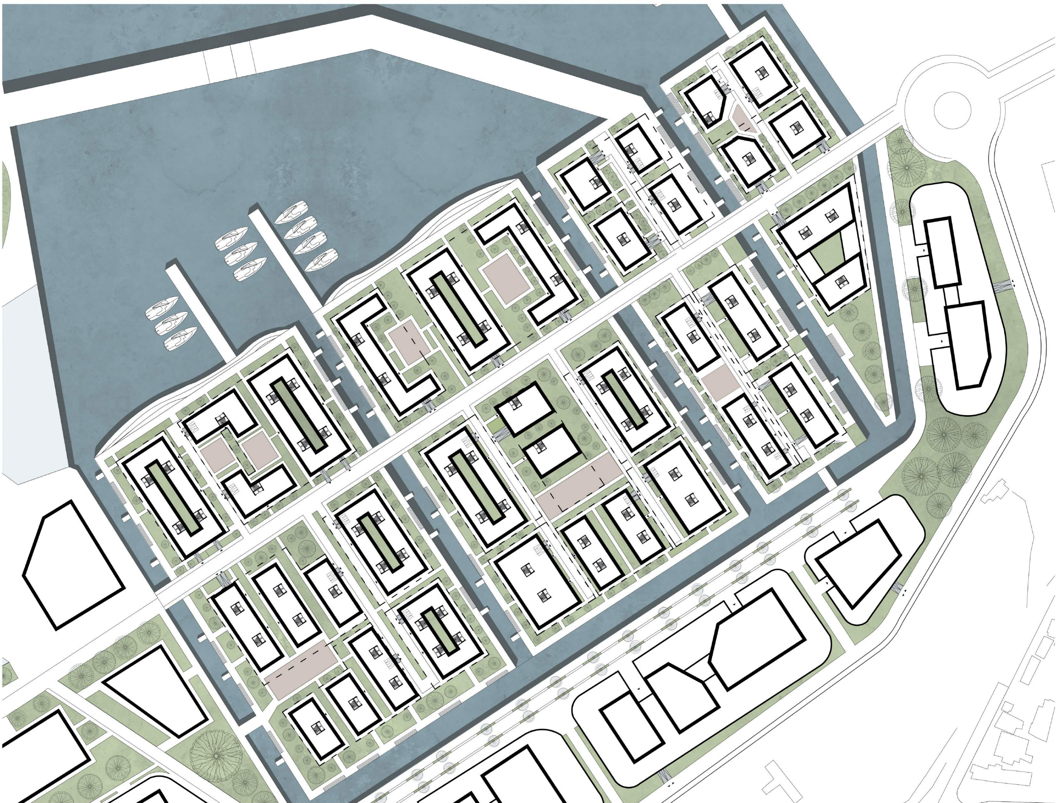
CONCEPT DESIGN, SCALE 1:2000

- The blast of the area resulted in creating a lot of waste in material such as steel, wood and glass that could be potentially reused in regards to renovating the area.