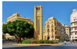
2. Place de l'Etoile