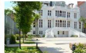
4. Sursock Palace