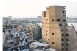
1. Stone garden

17:45, 4 August 2020 218 death 7.000 injured