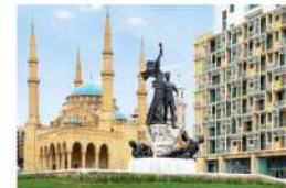
3. Mohammad Al Almin Mosque