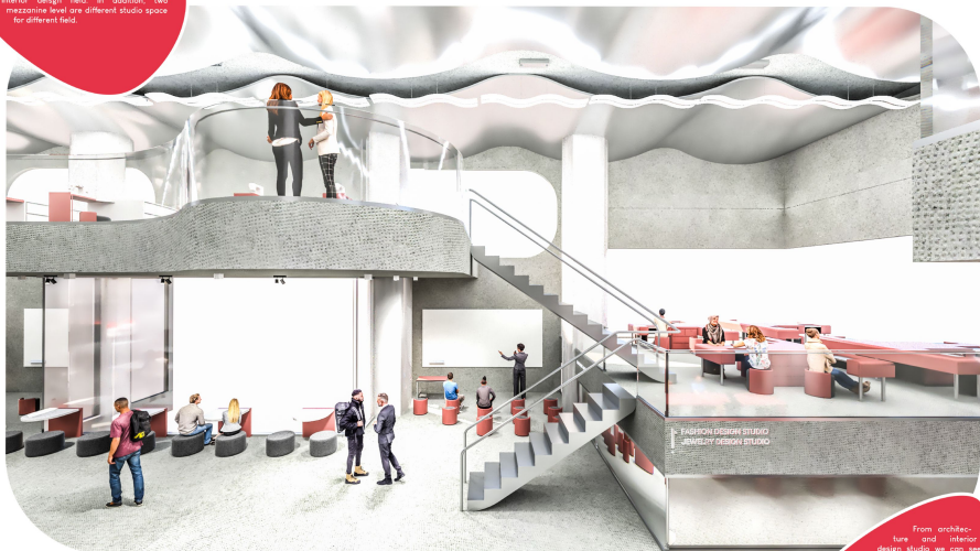
STUDIO COWORKING AREA

From architecture and interior design studio, we can see overall the studio space, from outside to inside. In addition, in all studio have different custom furniture help designer and creatives collaborate, operate different functions at the same time, to be creative and come up with unique ideas.