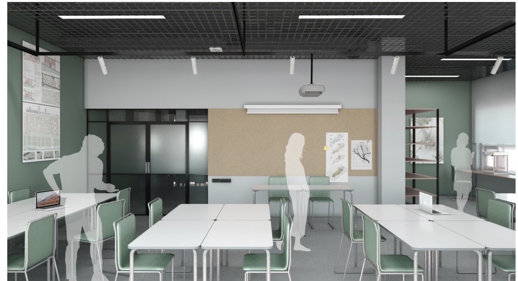
The auditorium is designed for teamwork of students, and therefore, the desks are grouped.