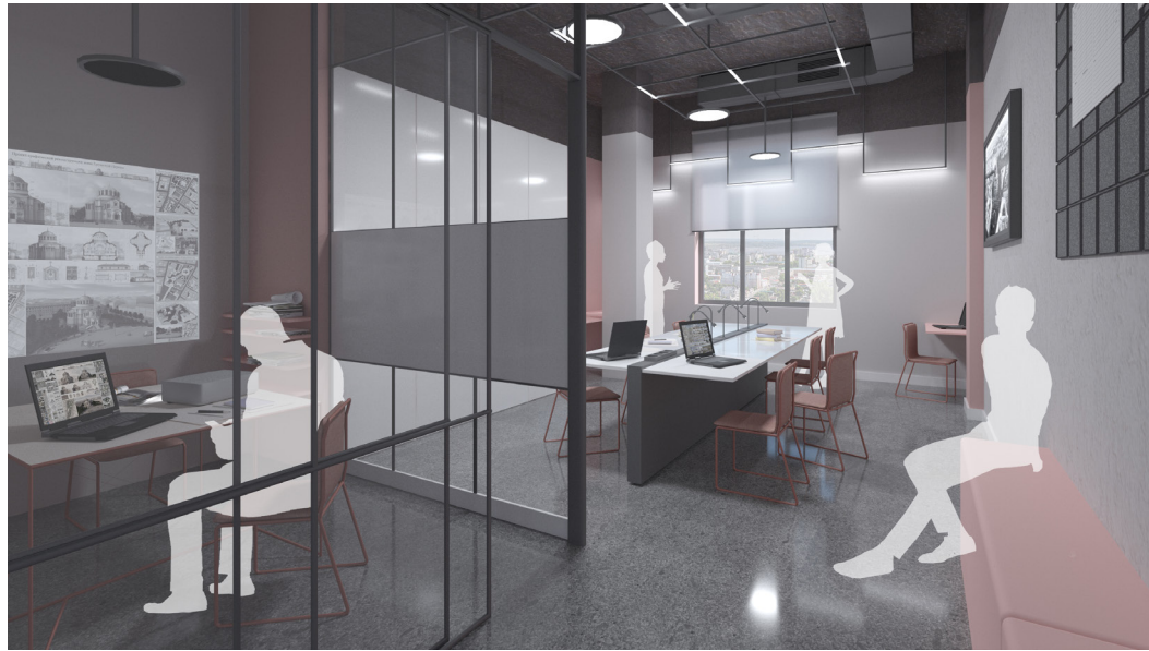
▲ One of the classrooms of the Department of Urban Planning. This auditorium is equipped with a variety of tables convenient for layout, 3D printers and storage areas. The auditorium is designed for teamwork of students, and therefore, the desks are grouped.