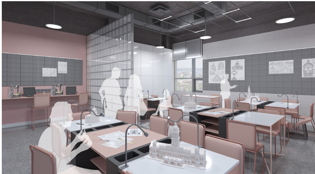
▲ An audience for practical mockups. There are many places for storage, tables with the possibility of sorting garbage.