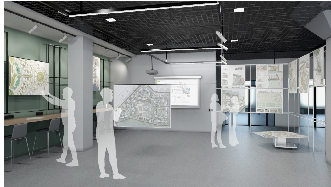
▲ Exhibition space/coworking. There is a multifunctional space with the possibility of deformation depending on the needs of the academy. Usually there is a soft area with poufs and tables with sockets. During the viewing, panels are pulled out to view the students' work.