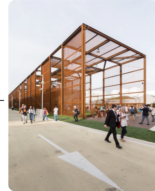
URBAN RECYCLING Introducing new content that activates derelict spaces and supports creative economies