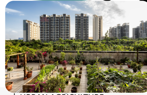
URBAN AGRICULTURE Urban gardens and implementation of green infrastructure in areas that require urban revitalization