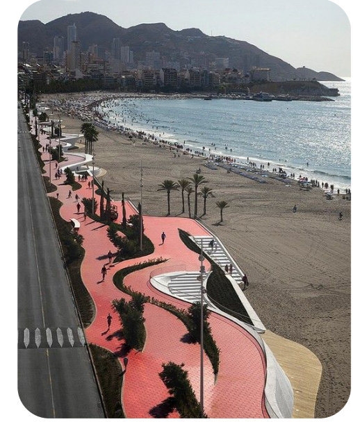
COAST Landscaping of the coast in order to use the space as a recreational public purpose, which through urban recycling become tourist attractions