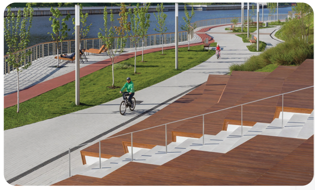
SUSTAINABLE URBAN MOBILITY Introduction of pedestrian and bicycle paths