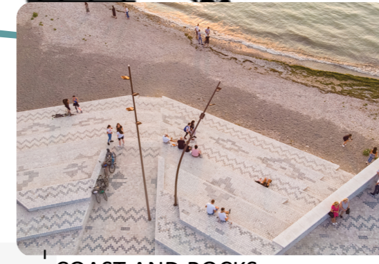
COAST AND ROCKS Landscaping of the coast in order to use the space as a recreational public purpose, which through urban recycling become tourist attractions