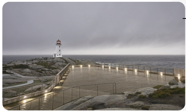
ROCKS Landscaping of the coast in order to use the space for recreational public purposes, which through urban recycling become tourist attractions