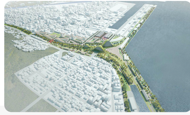
GREEN CORRIDORS A network of corridors that bring nature and freshness and enable safe movement of pedestrians and cyclists