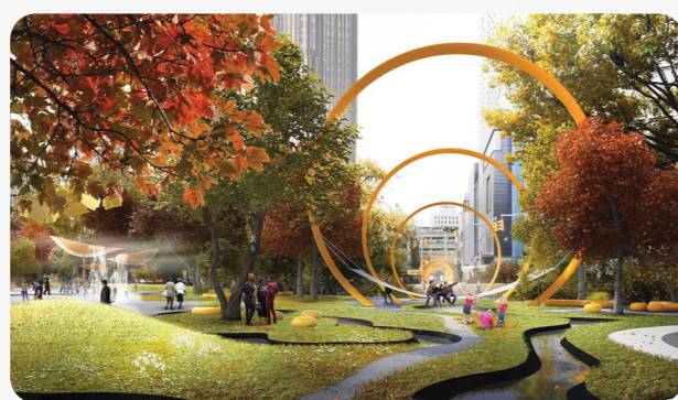
GREEN CORRIDORS A network of corridors that bring nature and freshness and enable safe movement of pedestrians and cyclists