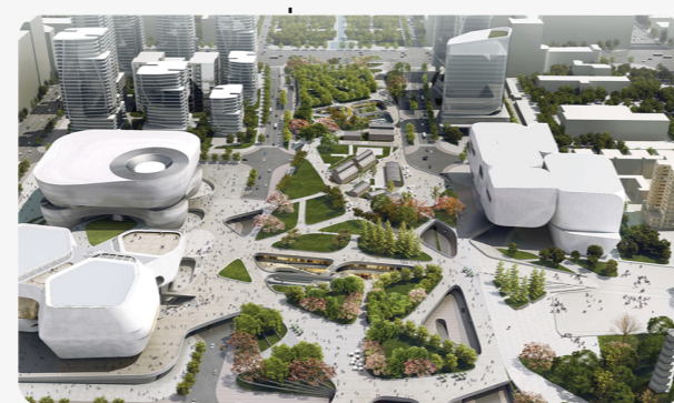
CENTRAL PARK Implementation of green infrastructure in the central city center