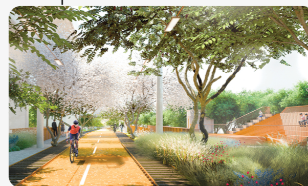
SUSTAINABLE URBAN MOBILITY New pedestrian and bicycle paths