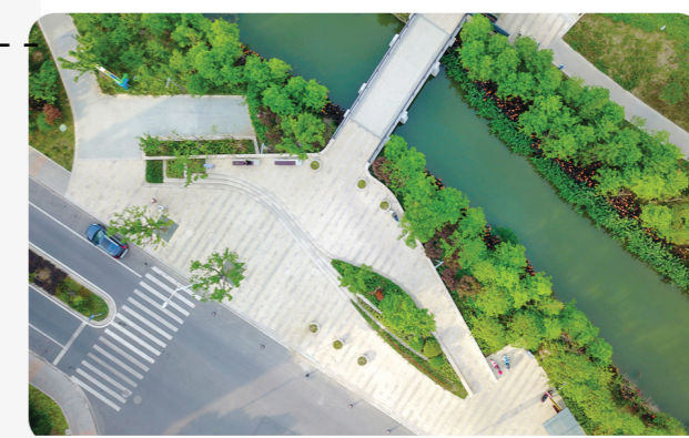
RIVER REHABILITATION Revival of the Beirut River as a long-term goal, continuity of content development and quality of life in the city