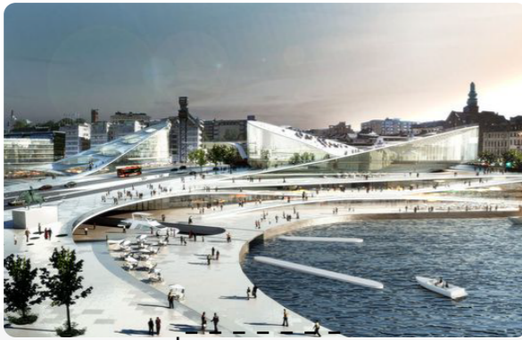
NEW CENTER Interpolation in the port zone Memorial center and accompanying facilities