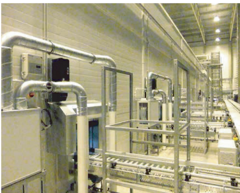
Hypoxic air fire prevention