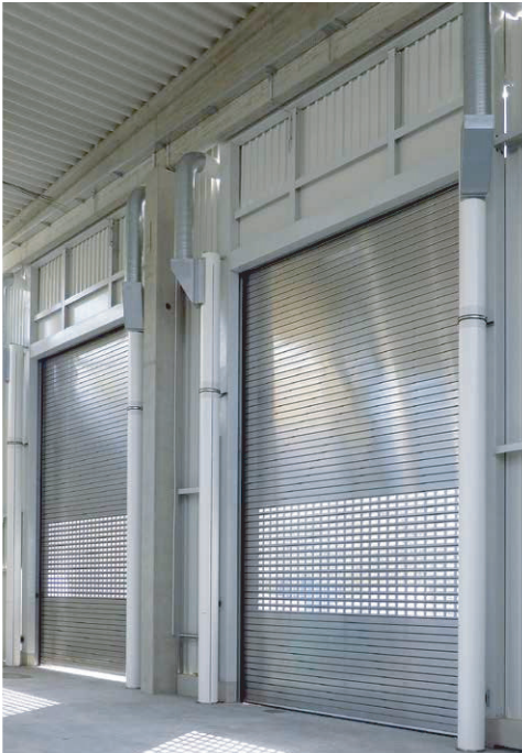
Pollution protection: recycling depot