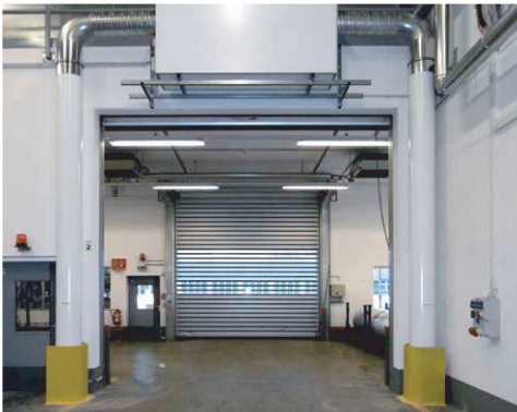
Industrial door: insect protection