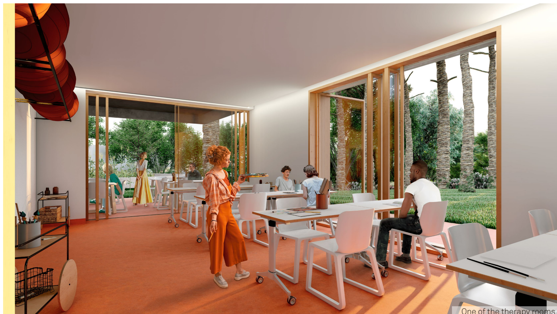
One of the therapy rooms