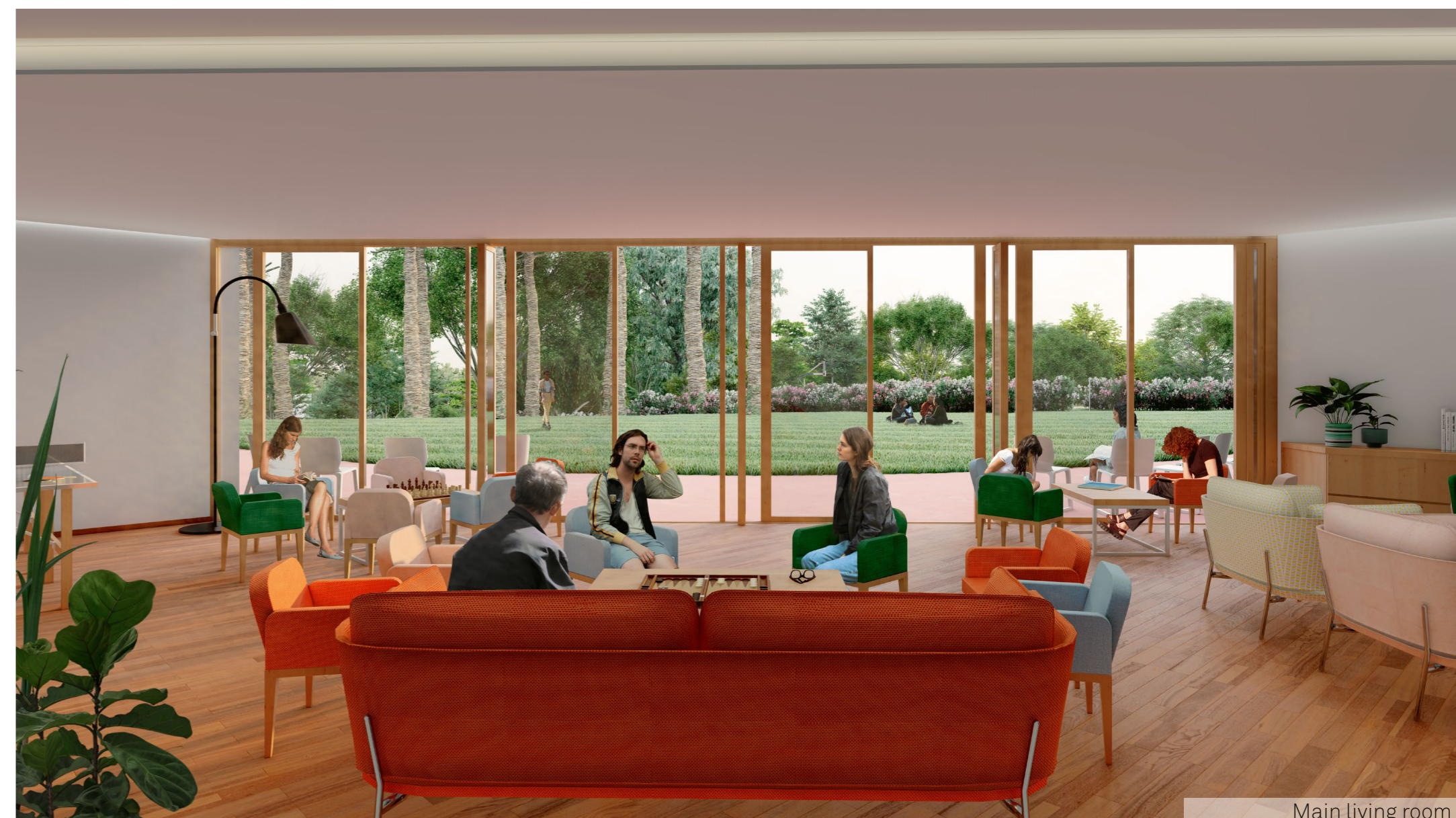
Main living room

The therapy rooms were designed to allow different types of practices. Due to that, they have movable walls between the rooms; flexible furniture (folding tables, stackable chairs, mats, etc) and large openings to the garden, which expand even more their therapeutic possibilities.