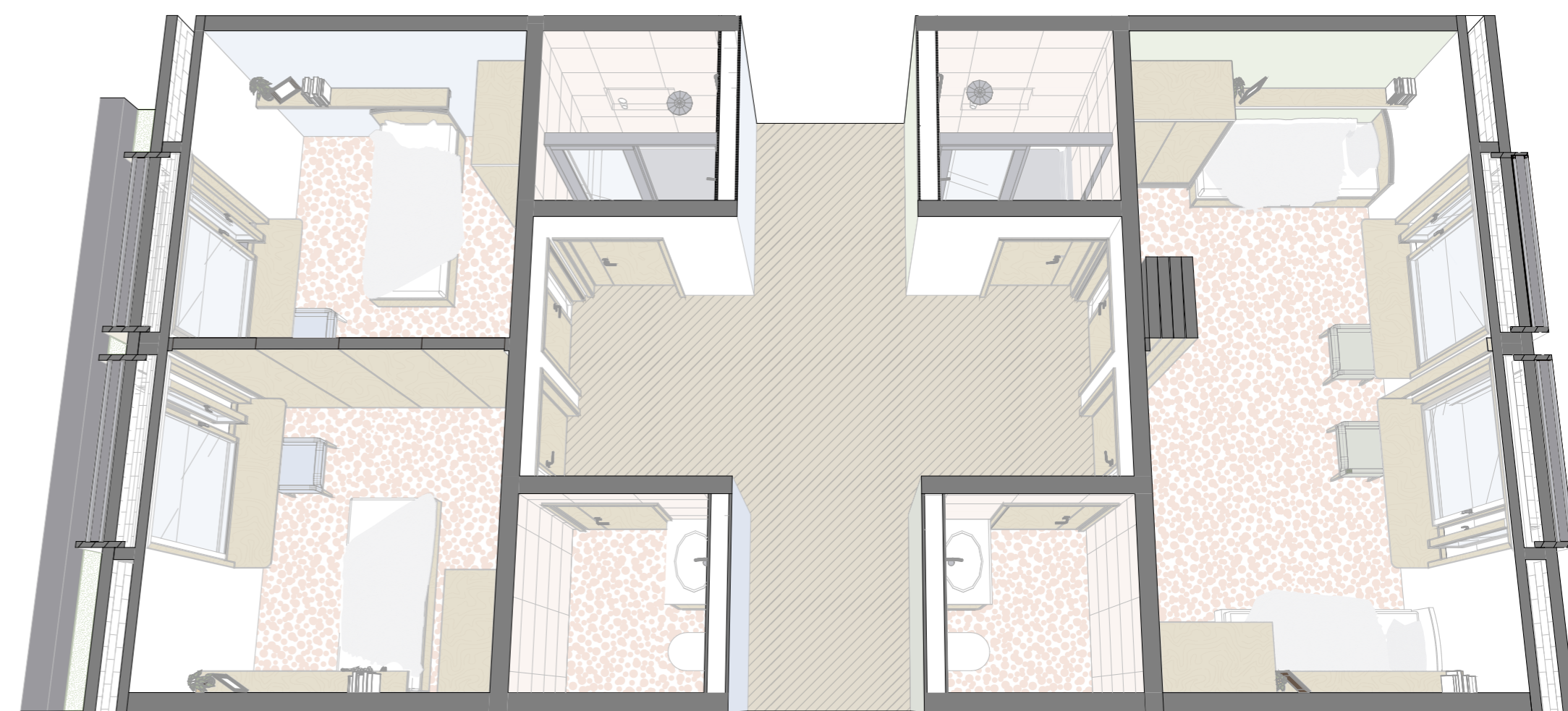
Bedroom, bathroom and hallway module