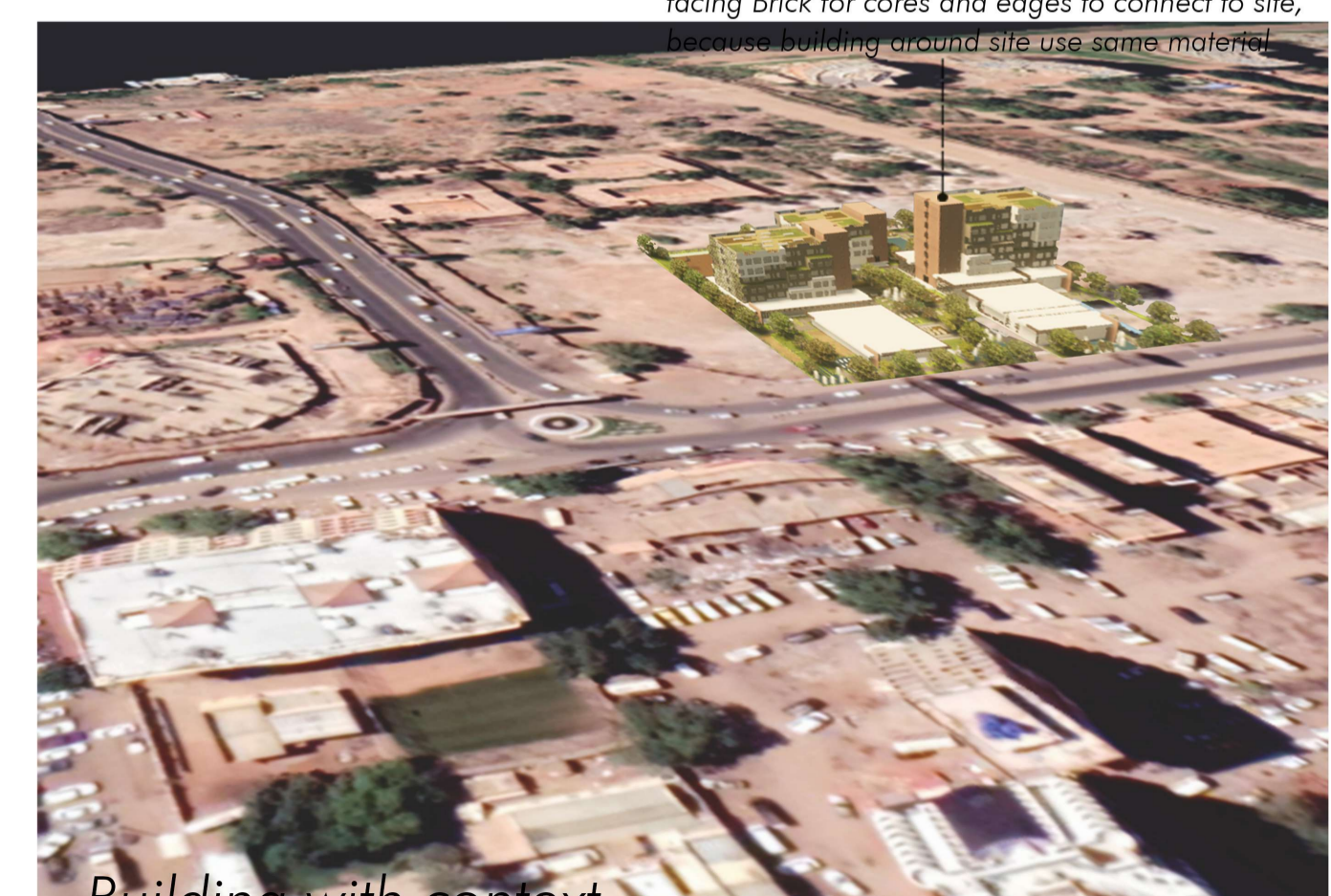
Building with context