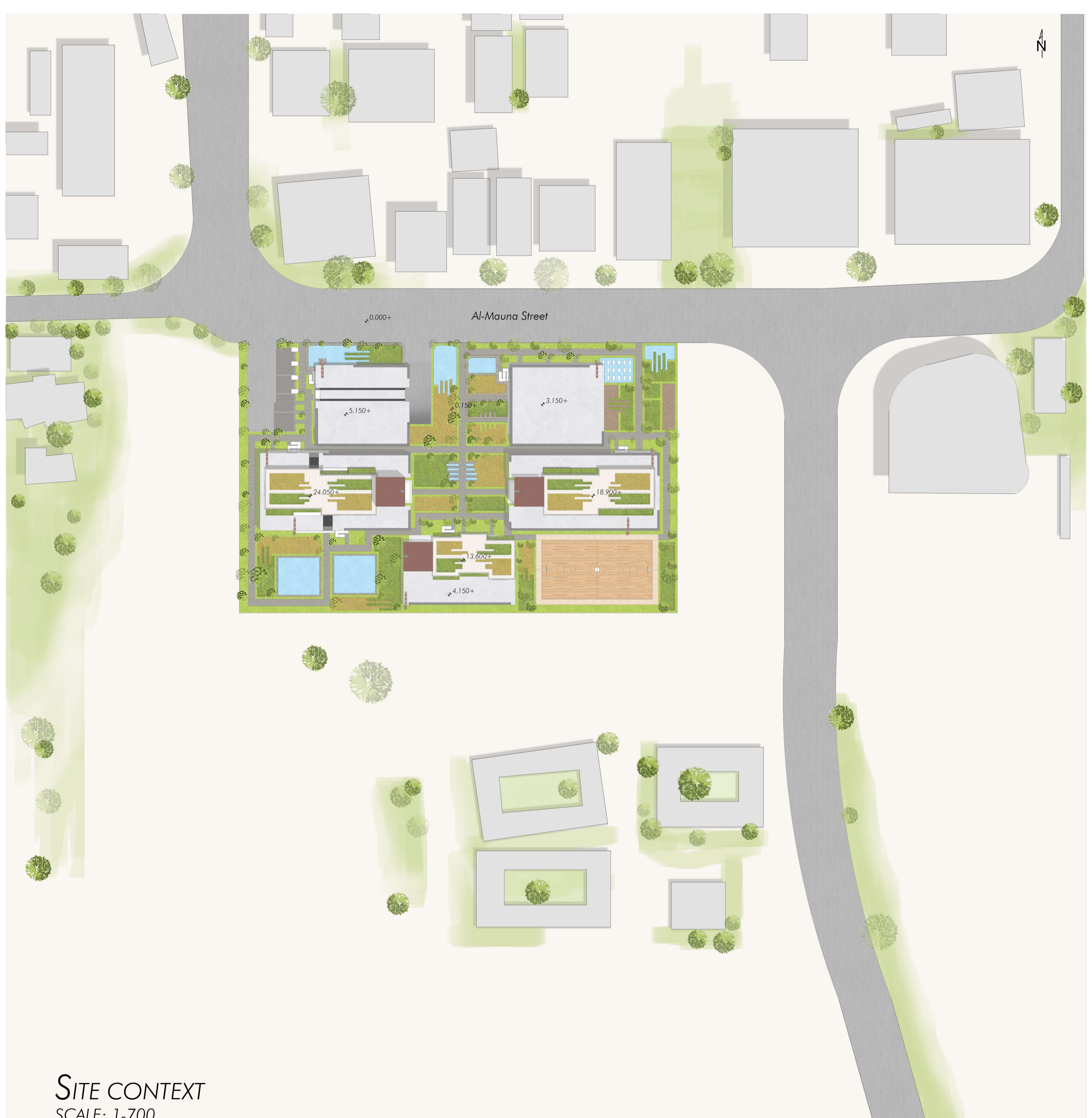
SITE CONTEXT SCALE: 1-700