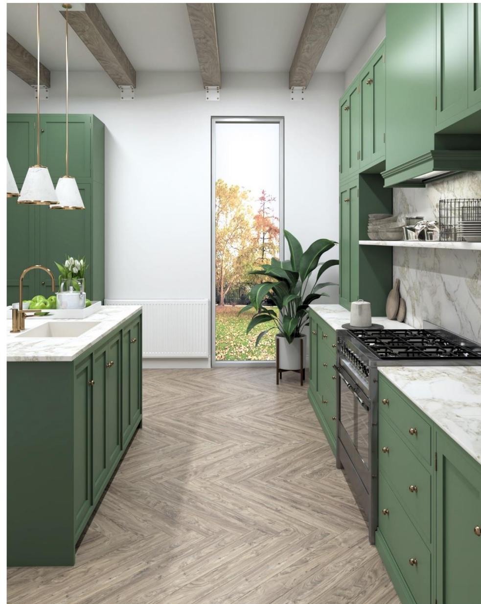
Software : 3ds Max .Vray