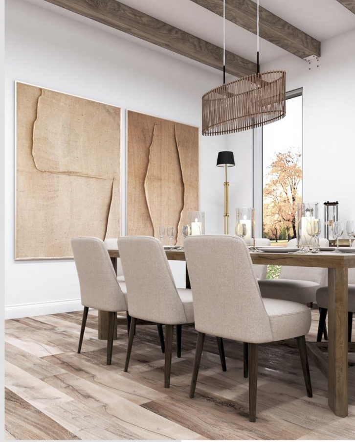
■ Dining Room Design Software : 3ds Max . Vray