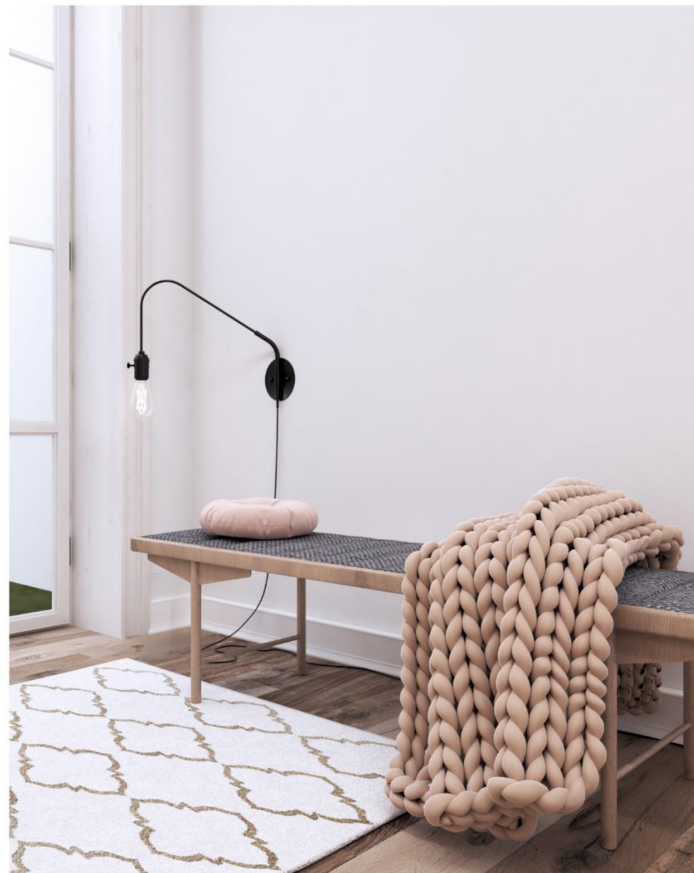
Software : 3ds Max .Vray