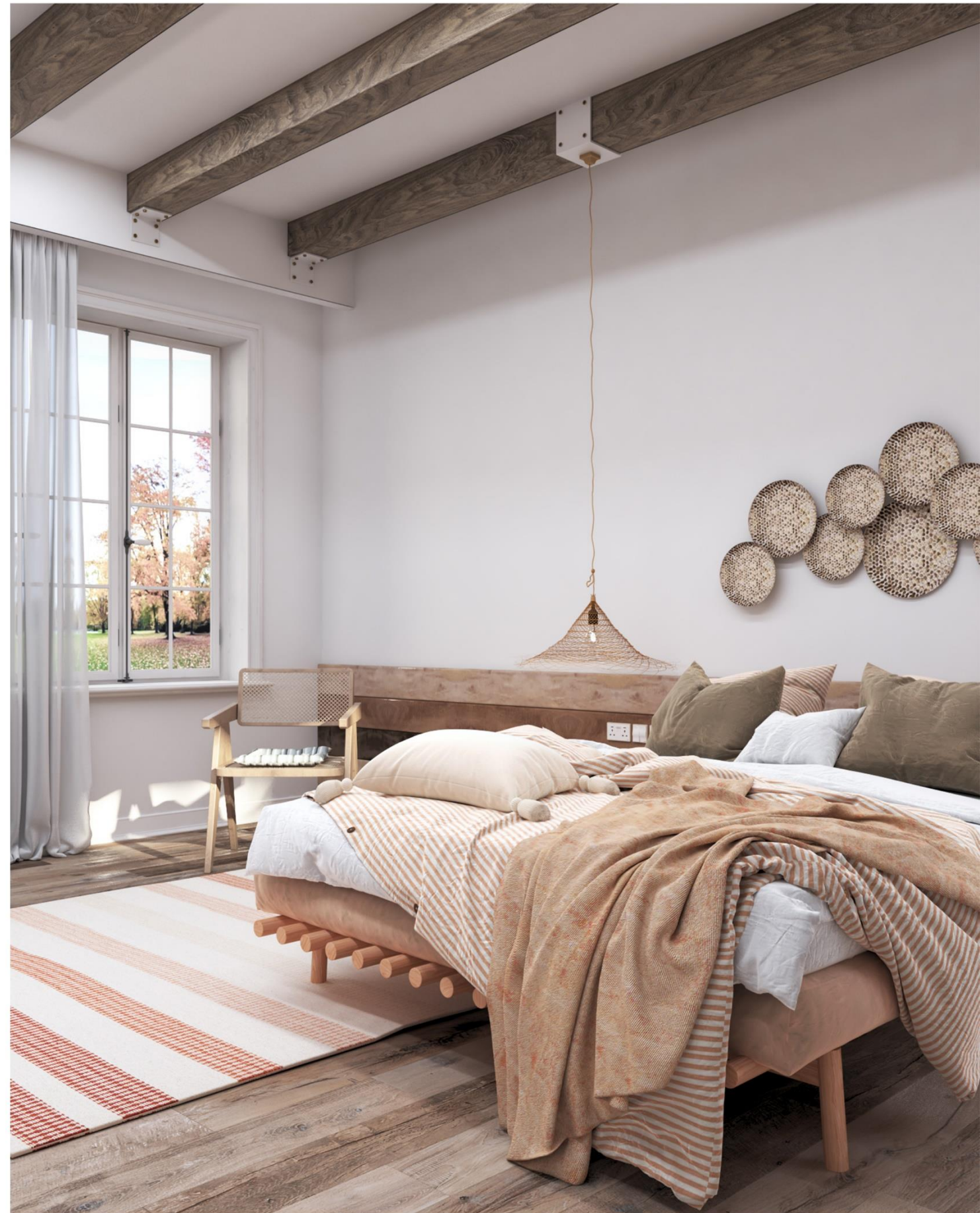
Software : 3ds Max .Vray