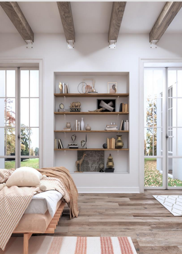
Software : 3ds Max .Vray