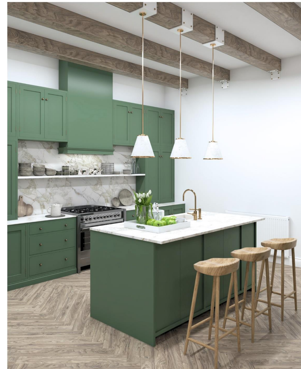
Software : 3ds Max .Vray