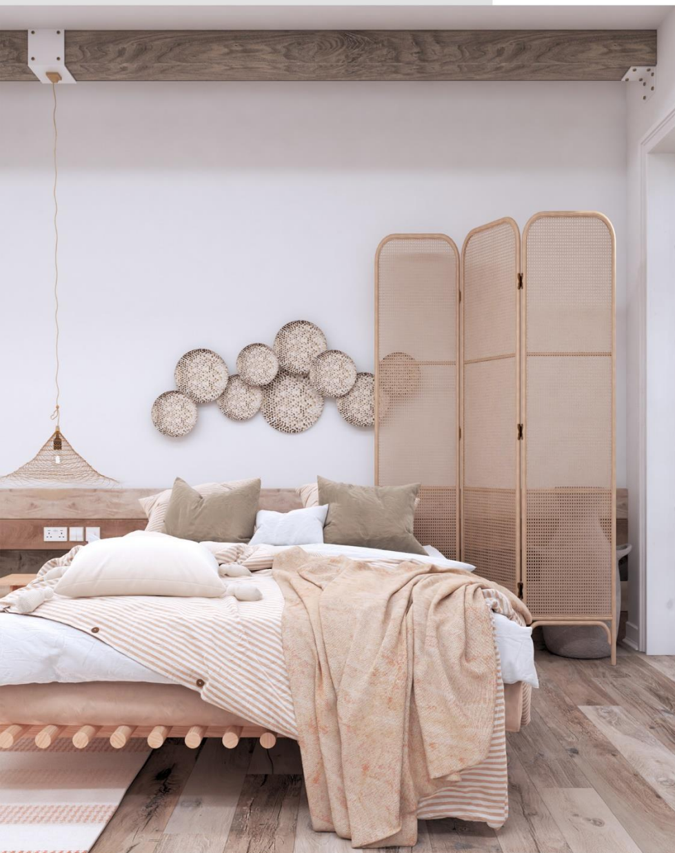
Software : 3ds Max .Vray