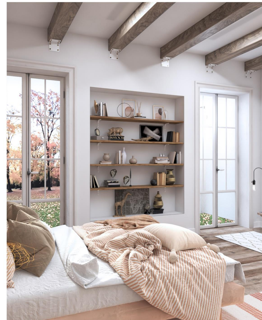
Software : 3ds Max .Vray