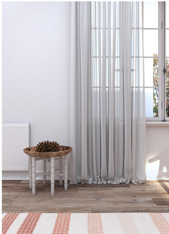
Software : 3ds Max .Vray