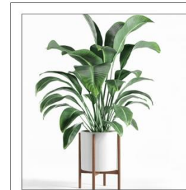
CAST IRON PLANT