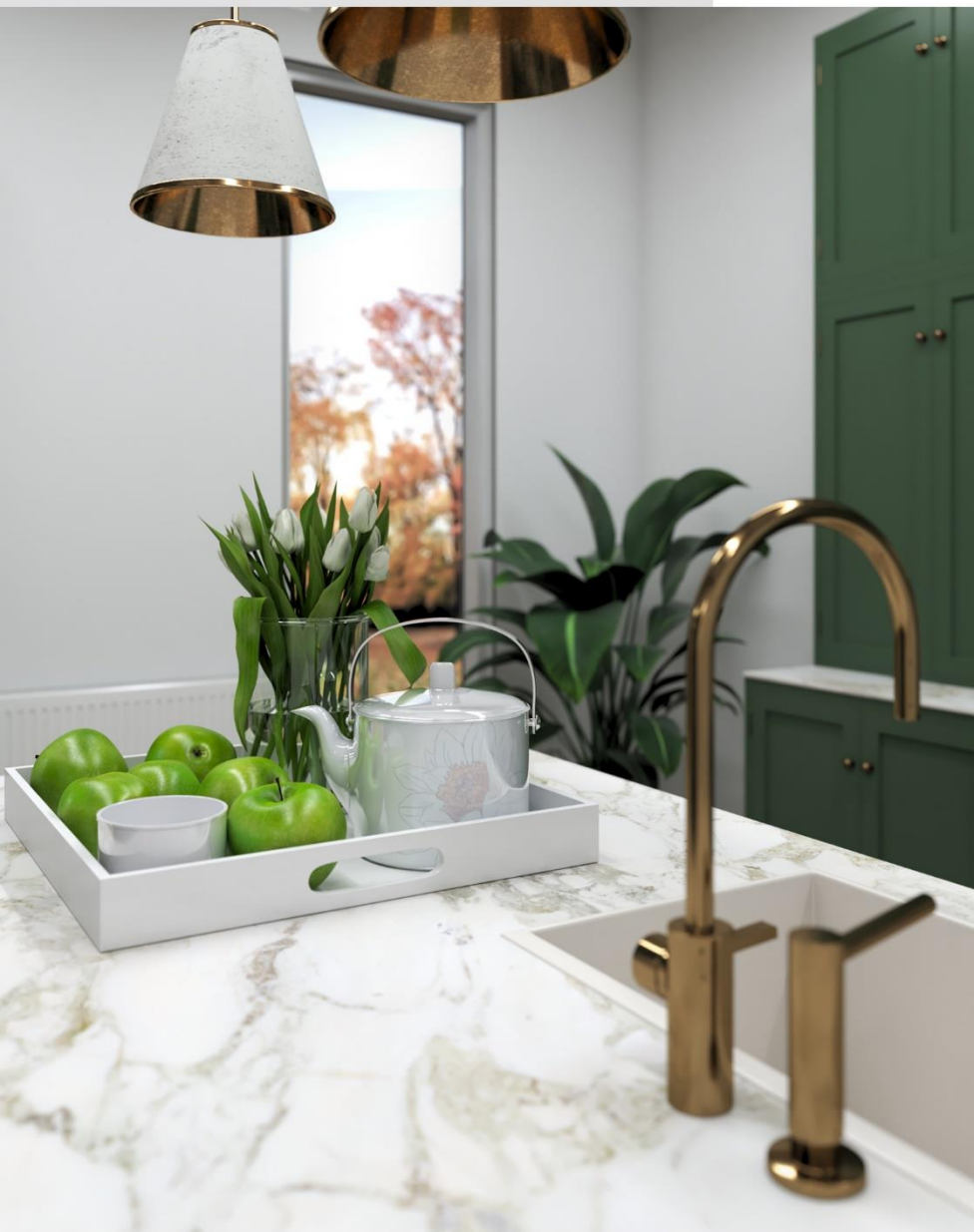
Software : 3ds Max .Vray