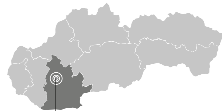
NITRA REGION, NITRA