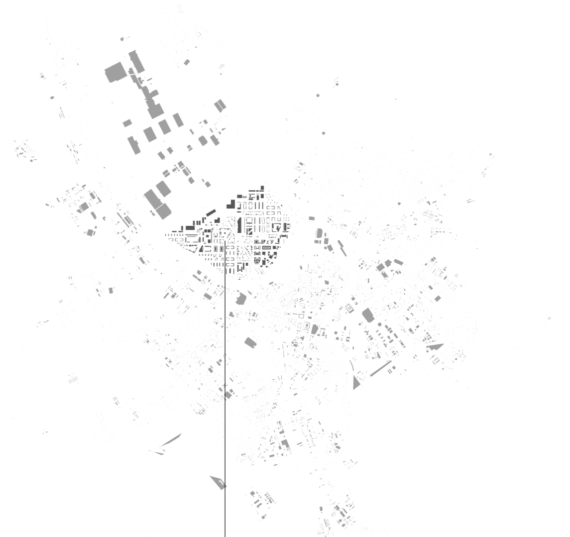
NITRA, PÁROVSKÉ LÚKY