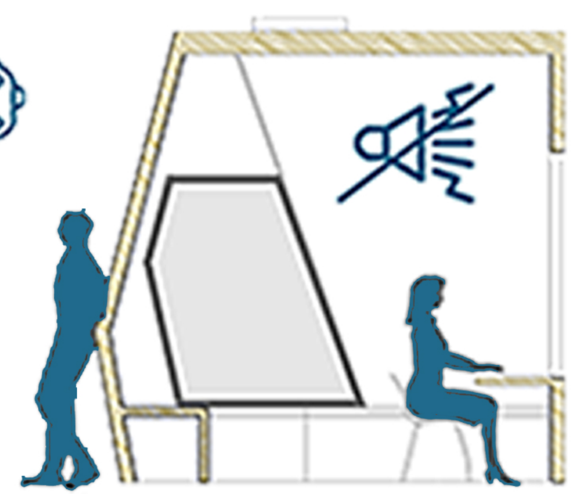
FOR QUIET LEARNING