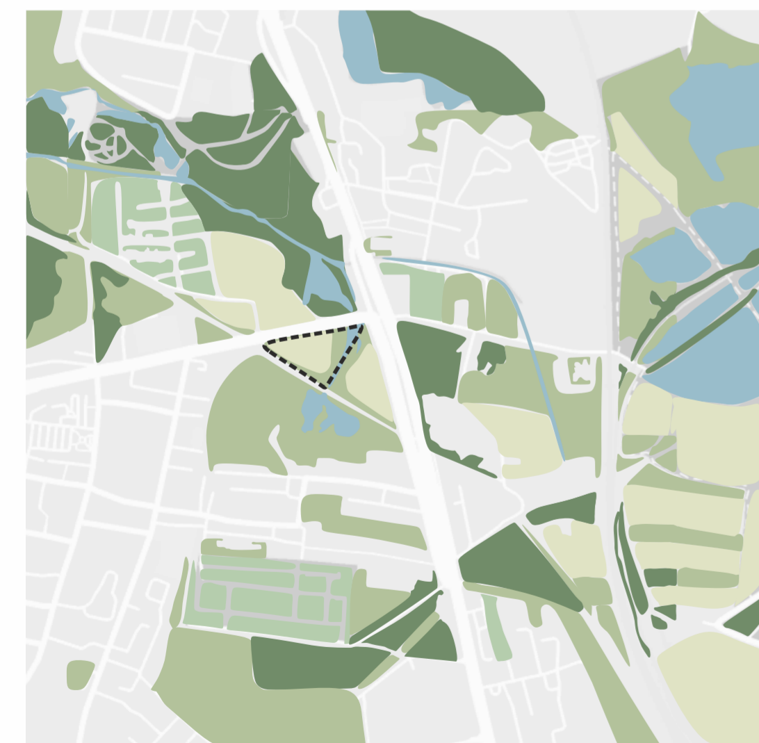
VEGETATION AND WATER