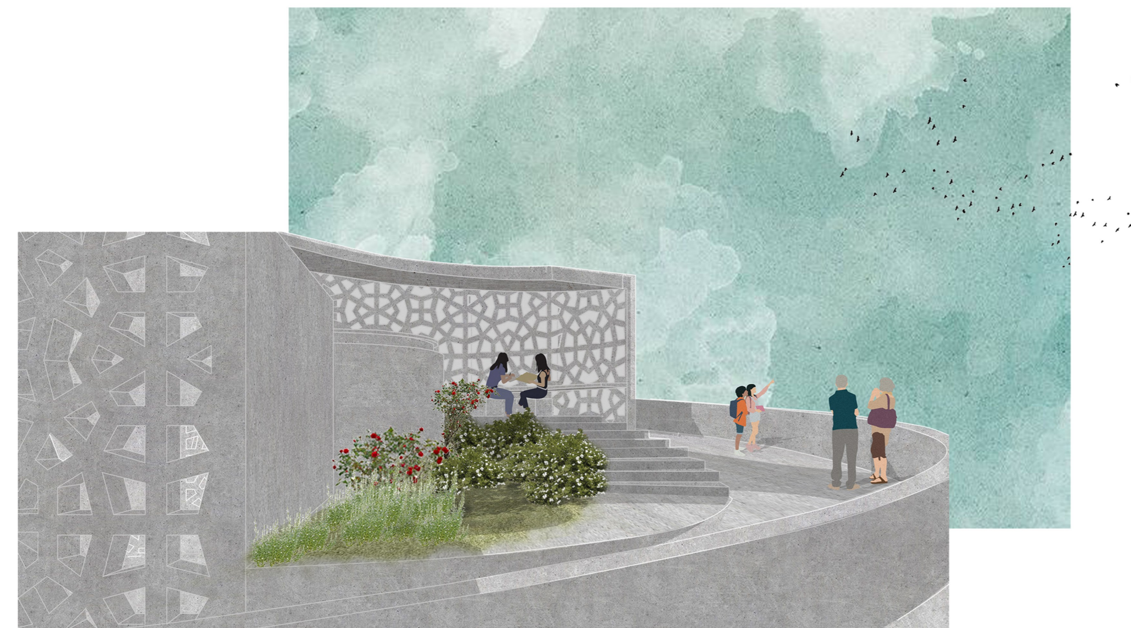
View point at the top level, The journey within the mosque through city gallery which showcases the story of the city is ended up by giving an opportunity for people to see their present city lively in a big picture