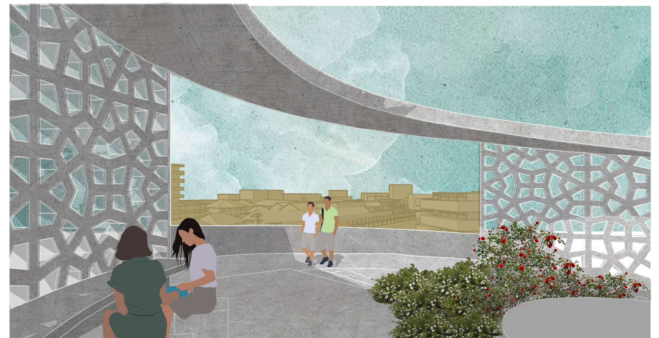
Resting area in the roof turf, Here within the jusmin flower beds with other aromatic flower plants creates an interesting resting area with electrical supply which is very usefull for students and others for waiting beacause the city identified as an education hub

JASMINE GARDENS | Jusmin flower beds inspired from traditional Islamic aromatic gardens