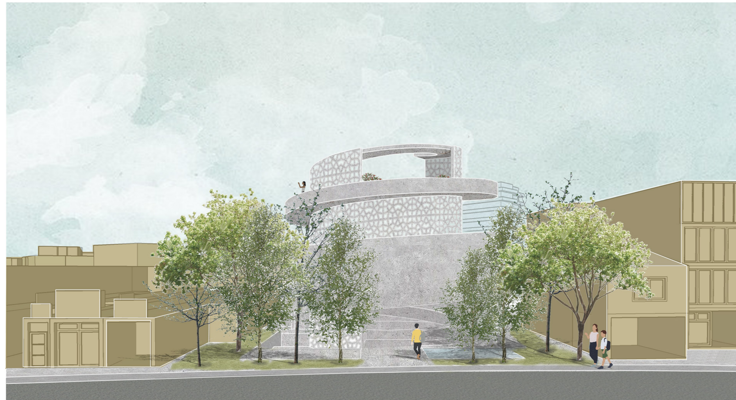
Exterior view of the mosque, being part of the urban fabric of the Nugegoda city by performing a unique identity to itself and to the city