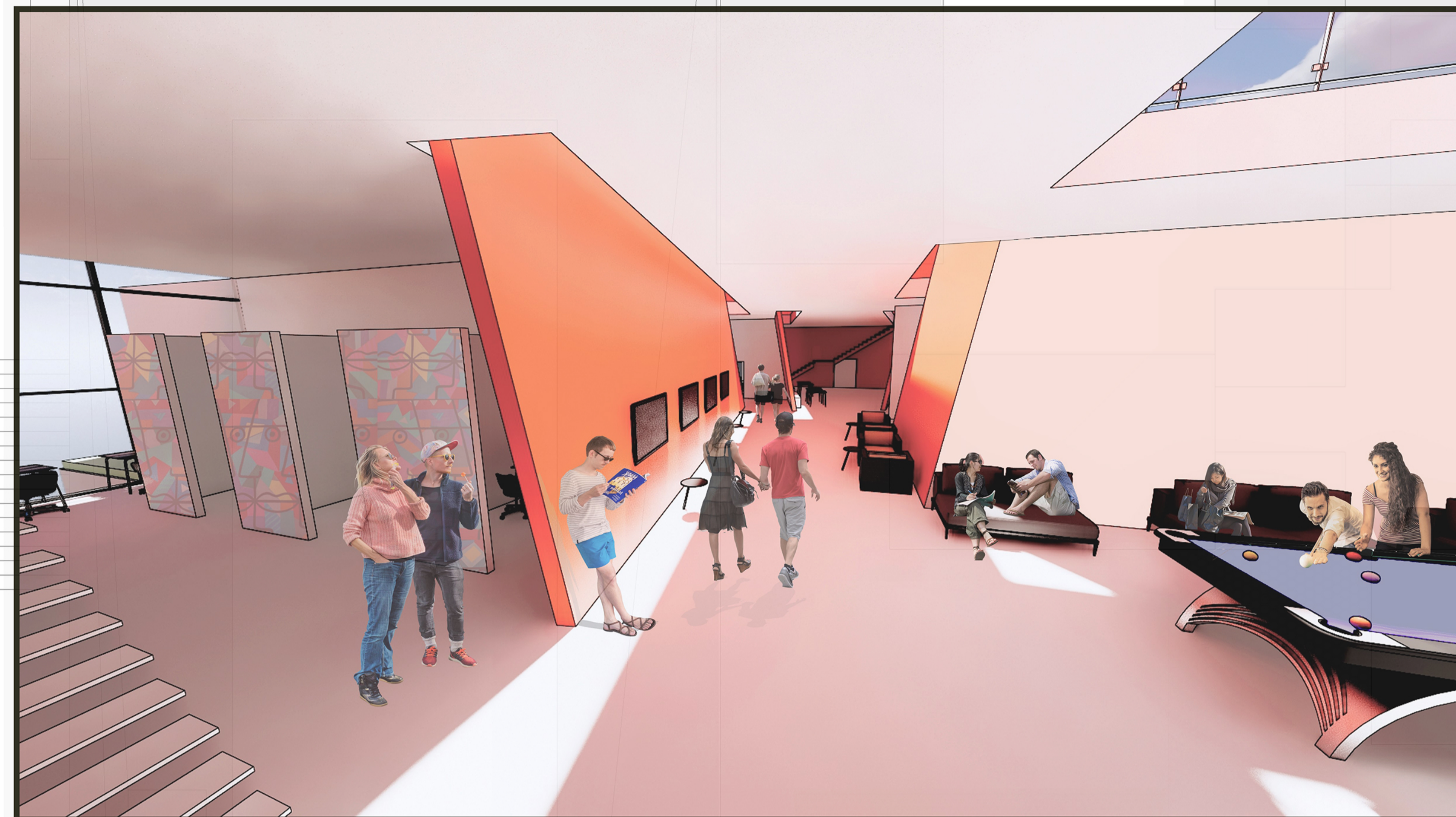
Start up center