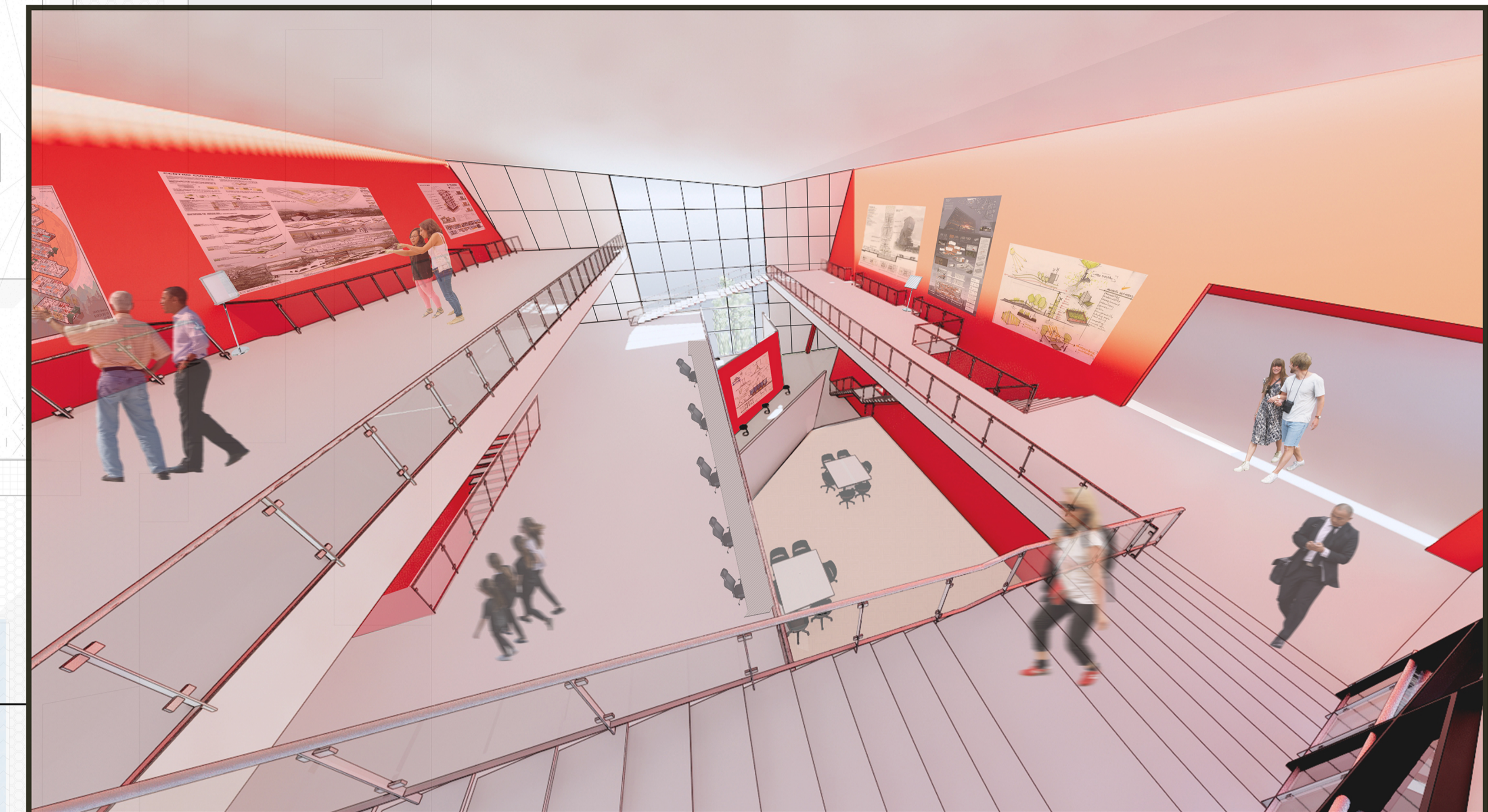
Display area along with learning areas