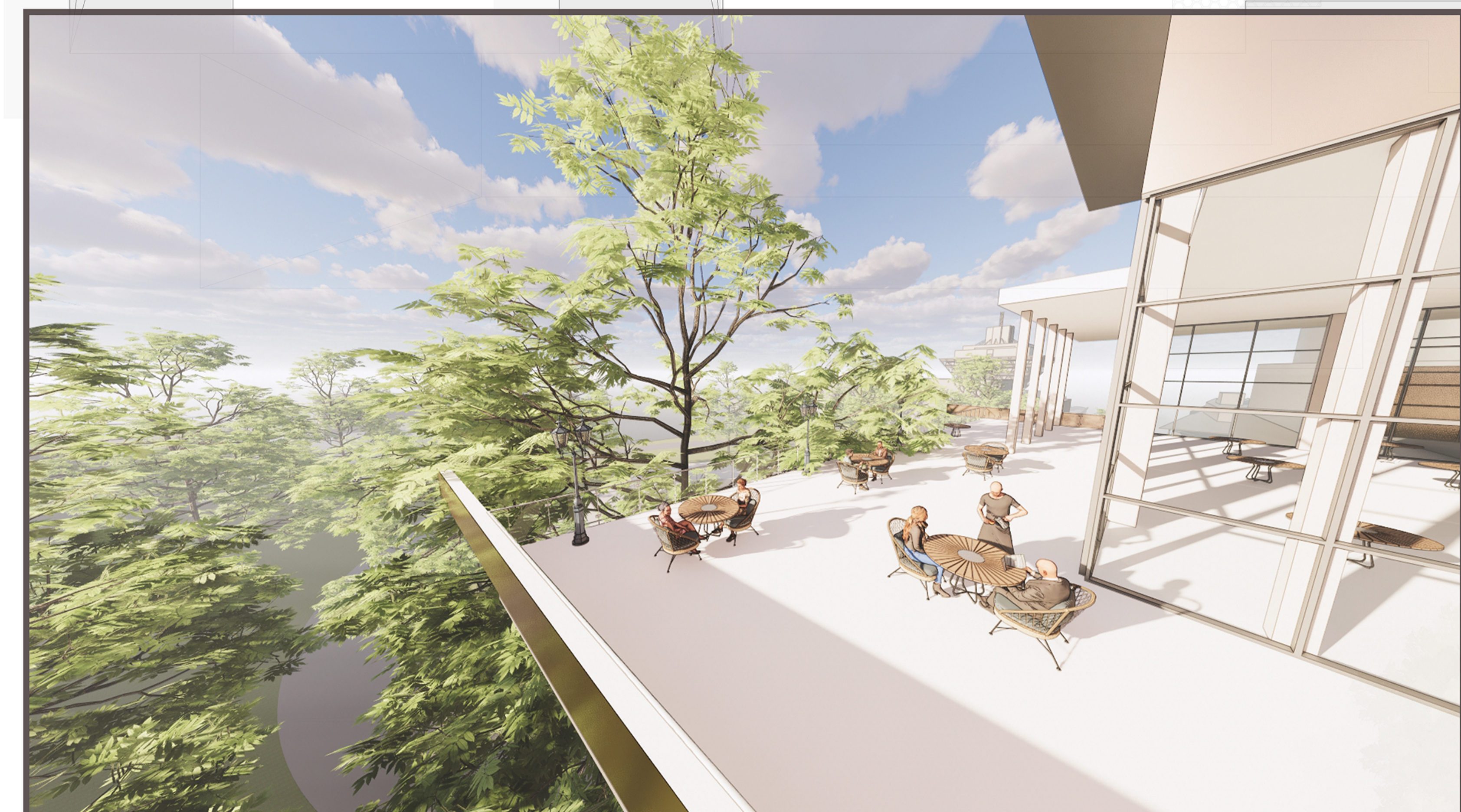
View from the cafeteria to the park