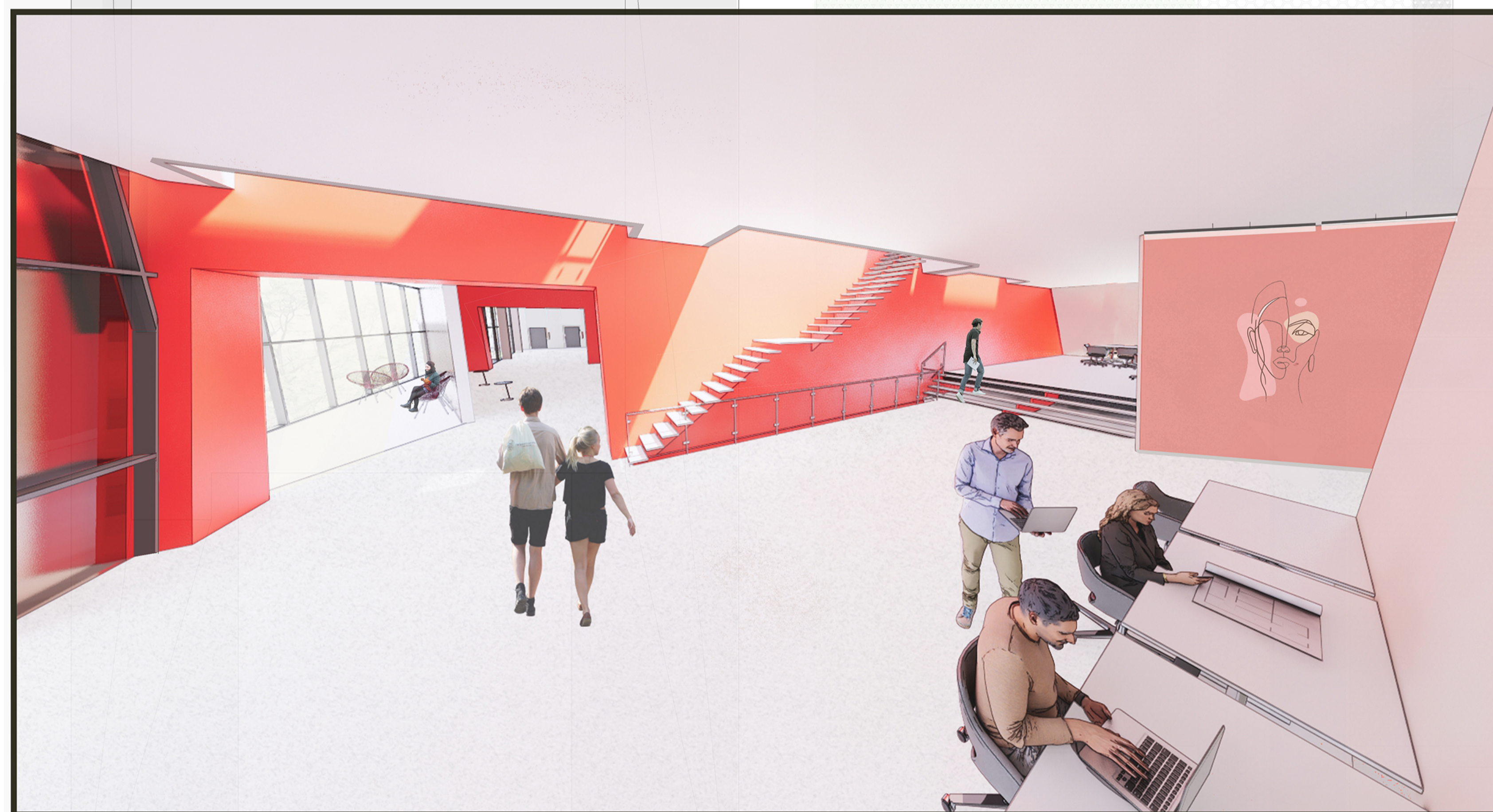
Display area along with learning areas