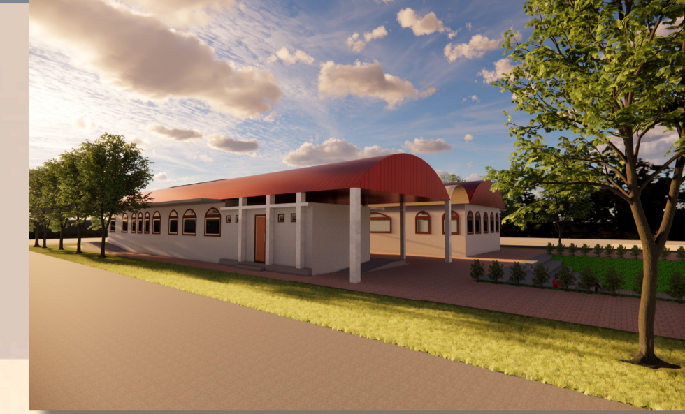
SOUTH-EASTERN FACADE OF PANCHAYAT GHAR & PUBLIC TOILETS