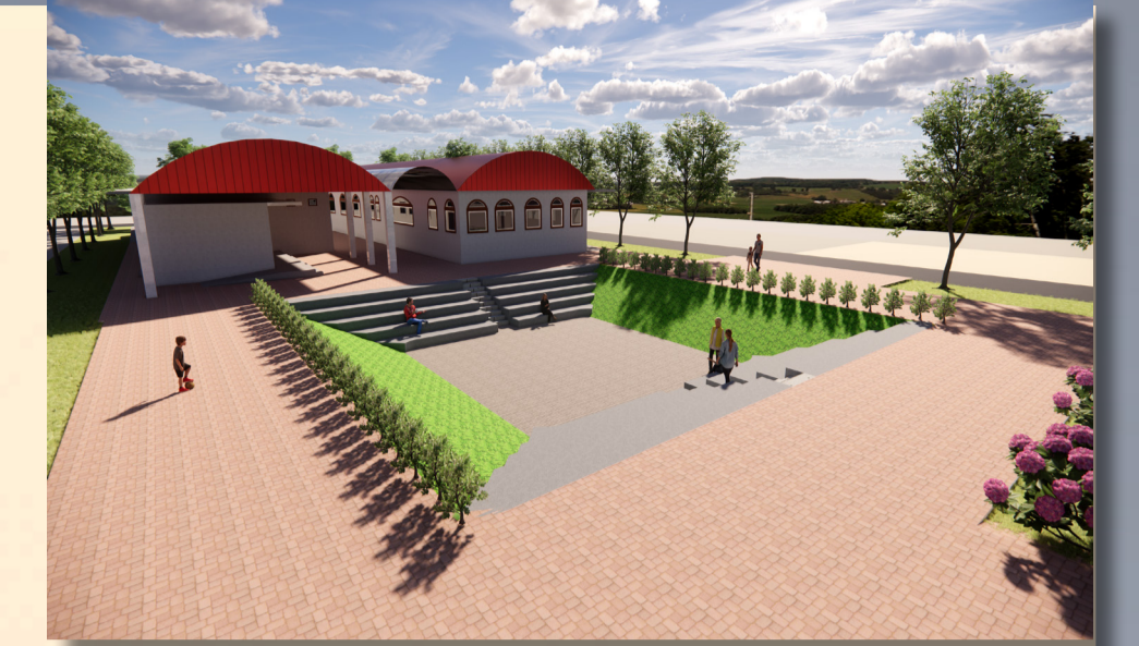
VIEW OF OAT INCLUDING GREEN SPACES