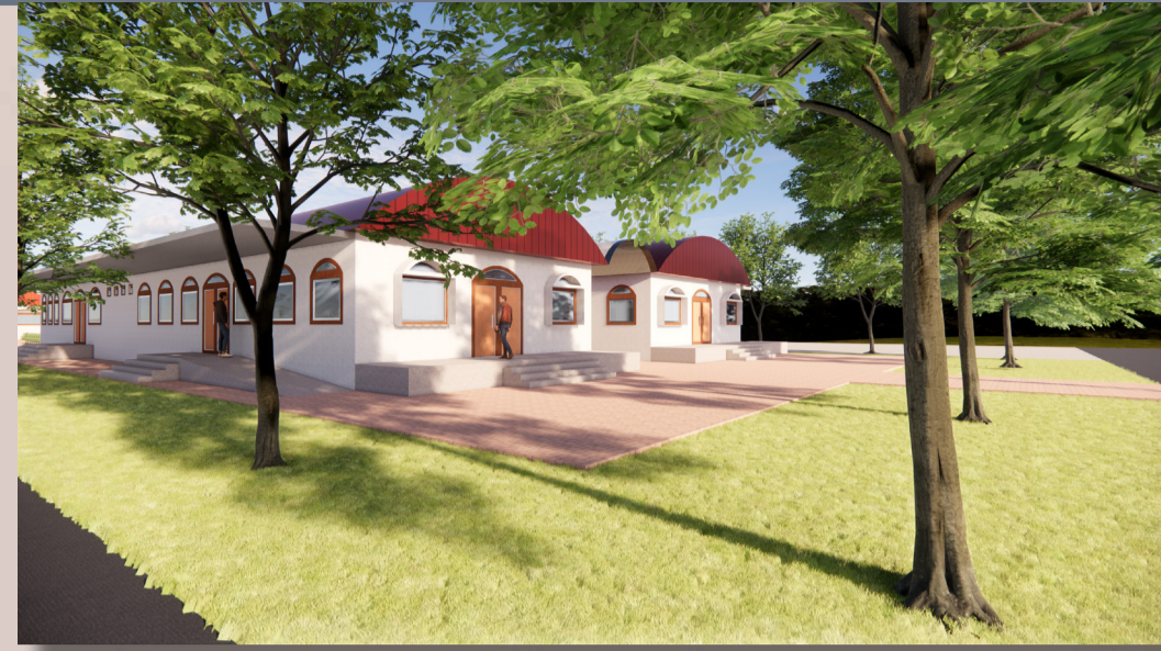
VIEW OF HALL, SENIOR CITIZEN CENTRE & PANCHAYAT GHAR