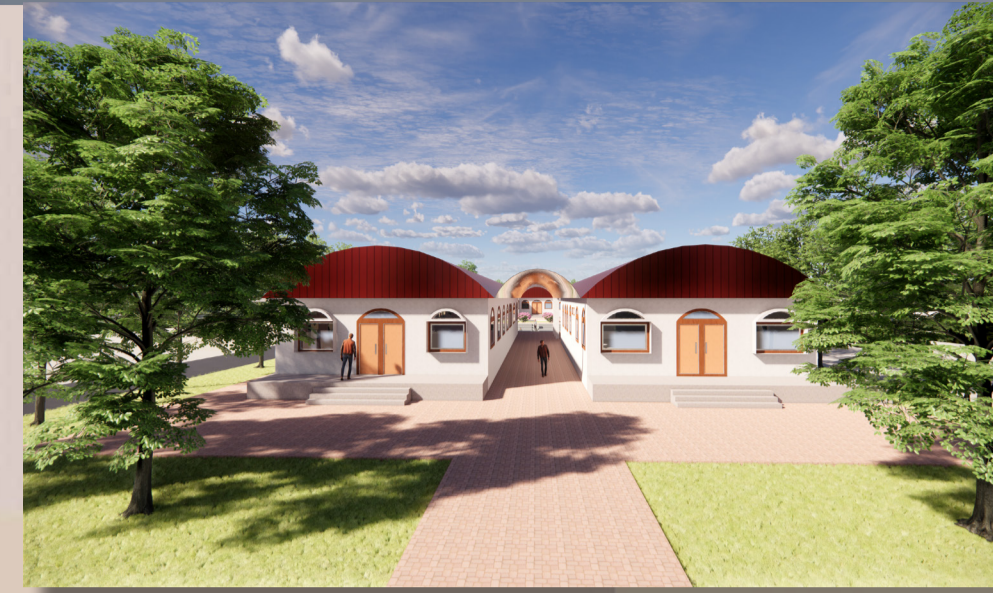
FRONT VIEW OF HALL AND PANCHAYAT GHAR WITH PERGOLA WALKWAY