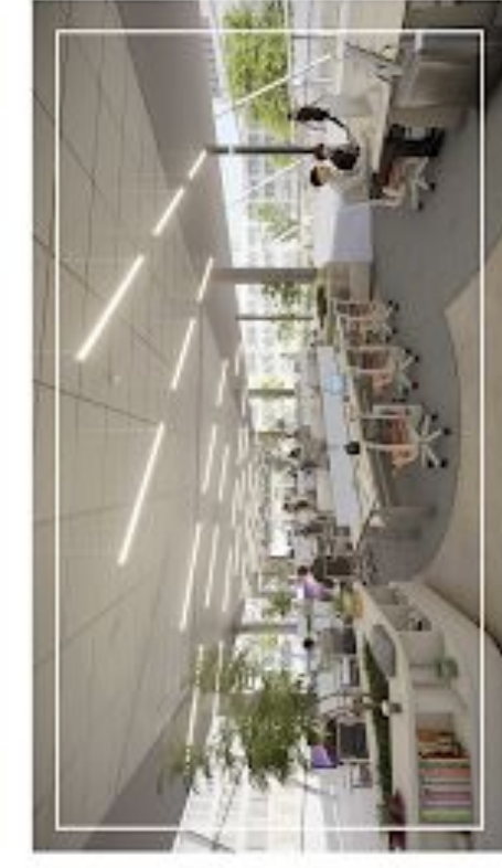
Interdisciplinary Research & Cooperation Center