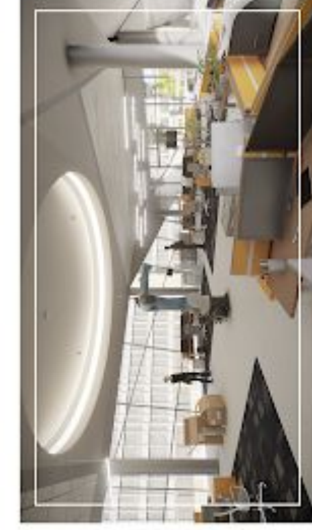
Research Center & Digital Fabrication Lab