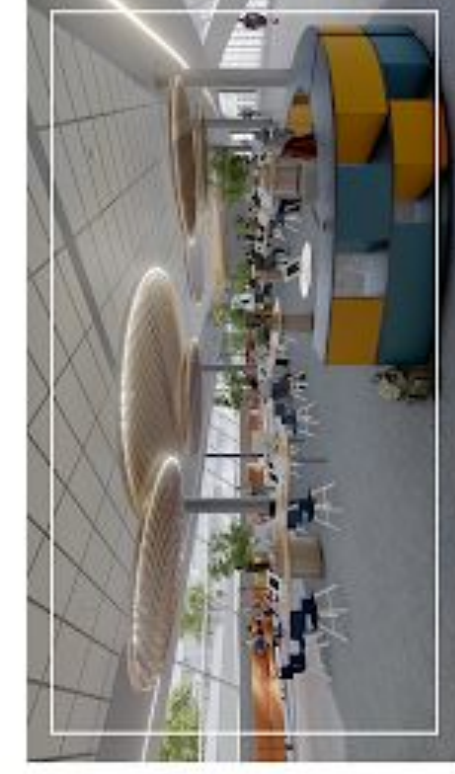
Media Library & Social Spaces