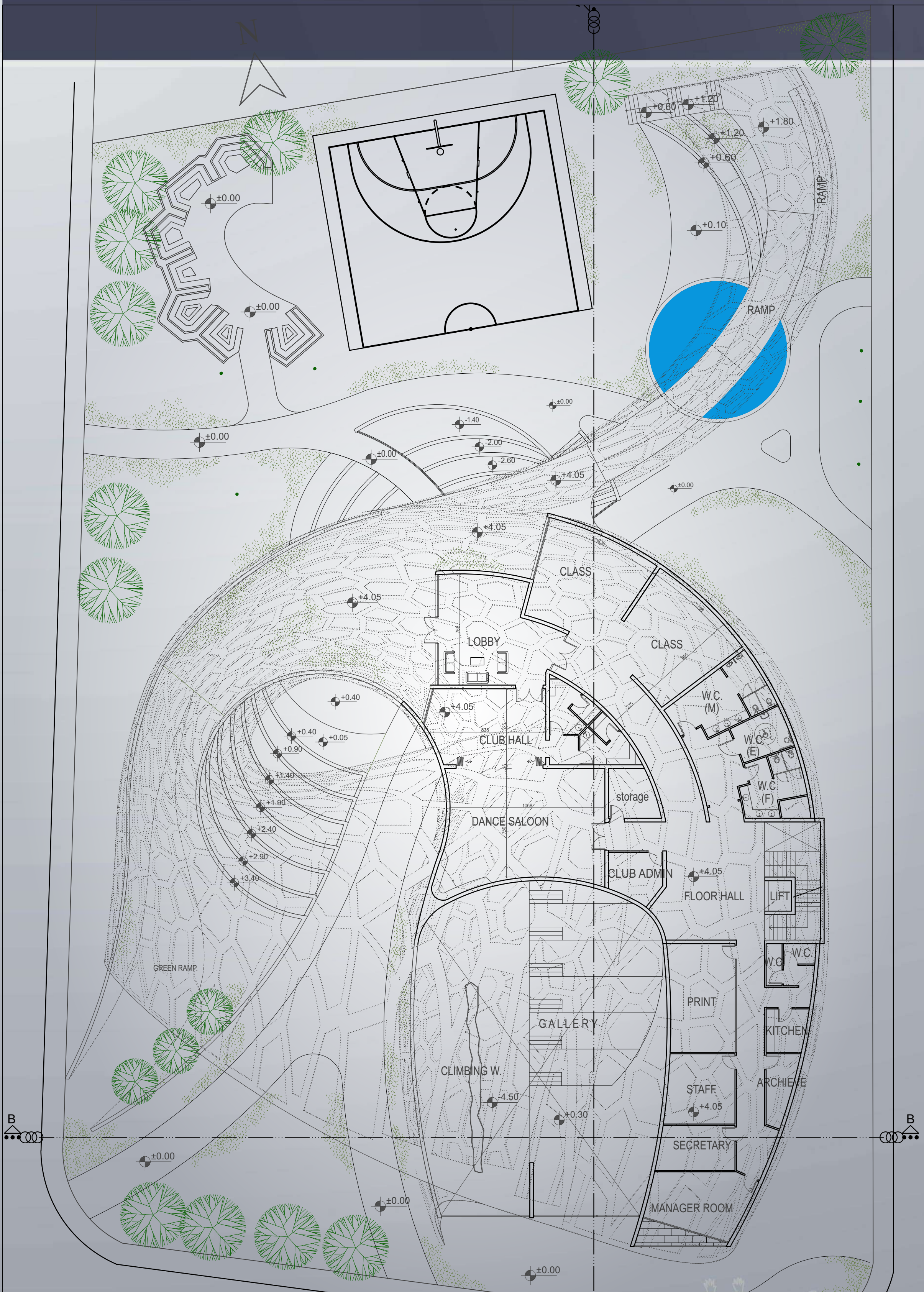
FIRST FLOOR PLAN Scale: 1/200