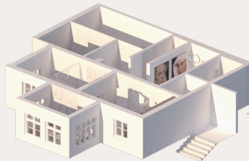
ground floor doctor's offices, reception, waiting room