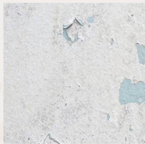
old plaster wall