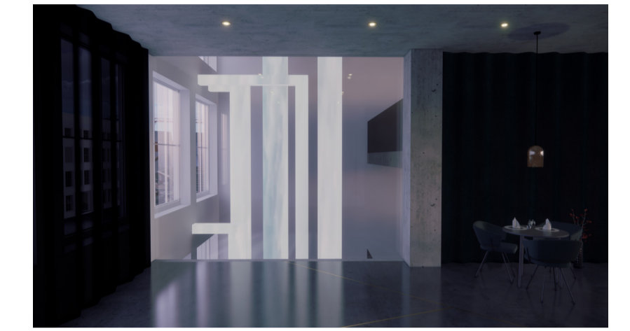
RECEPTION AREA & LOUNGE