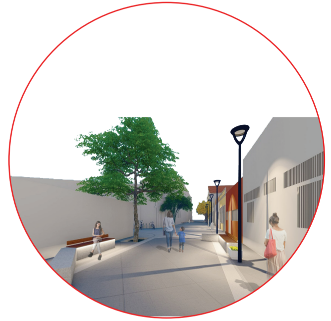
ALEGRIA STREET PROPOSAL