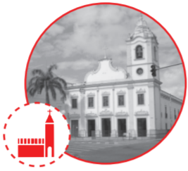
SANTA CRUZ CHURCH