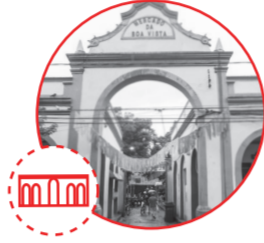
BOA VISTA MARKET