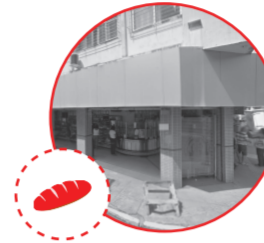
SANTA CRUZ BAKERY