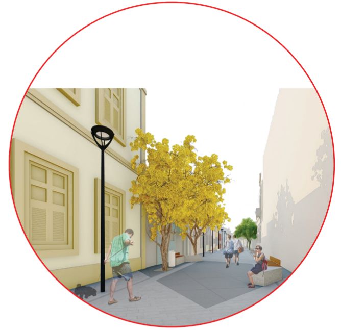
ALEGRIA STREET PROPOSAL