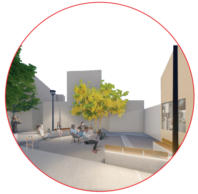
OUTDOOR MOVIE THEATER