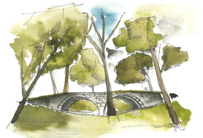
JAROVSKÁ BAŽANTNICA IS A PROTECTED AREA IN THE BRATISLAVA AREA. THE TERRITORY WAS DECLARED IN 2001 FOR A PROTECTED AREA. THIS AREA HAS PRESERVED BAROQUE LANDSCAPE.