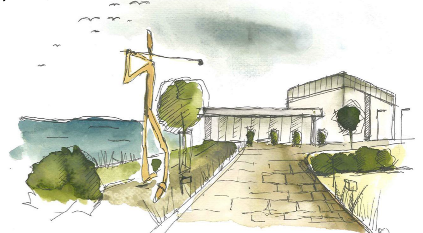
DANUBIANA, IS A MUSEUM OF MODERN ART LOCATED ABOUT 15 KM SOUTH OF BRATISLAVA NEAR THE CITY OF ČUNOVO. THE MUSEUM IS LOCATED ON A PENINSULA ON THE DANUBE RIVER.