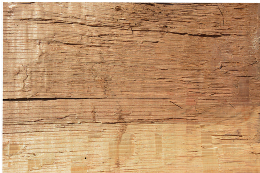
LOCAL WOOD- EASY TO FIND AND IT'S BEARING STRUCTURE