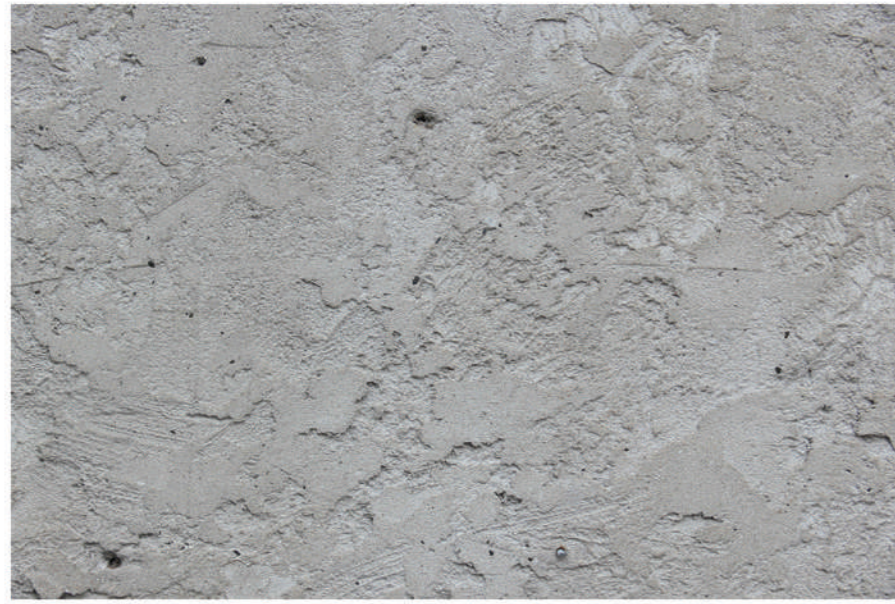
CONCRETE - HIDDEN STRUCTURAL MATERIAL IN THE BASE