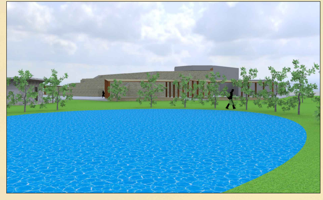
A view from the mini lake surrounded by trees - a place where the artists, guests or other visitors can use this place for relaxing, meeting each other, and other activities.