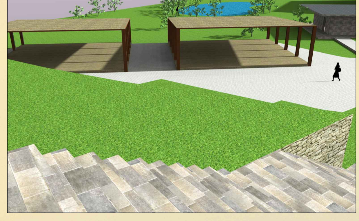
A view from the green terrace to the educational spaces where artists learn different disciplines as dance, theatre, music, circus and puppets. Also this spaces can be used for other activities like music gigs and different performances. The spaces are open and the guests can watch the activities.